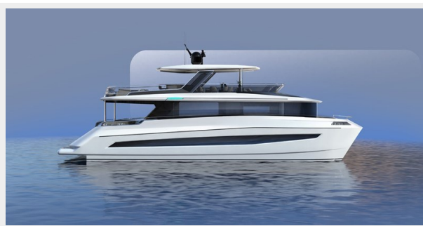
Xcel 70 profile