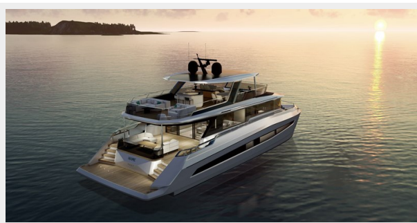
Xcel 70 perspective 2