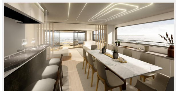
Xcel 70 main deck bar