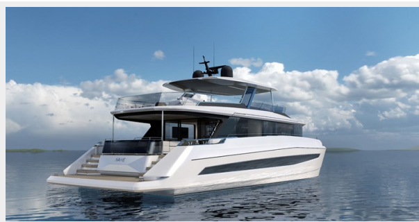
Xcel 70 back view