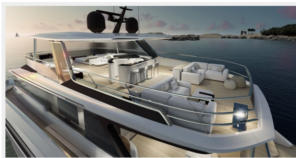
Xcel 70 Flybridge 3