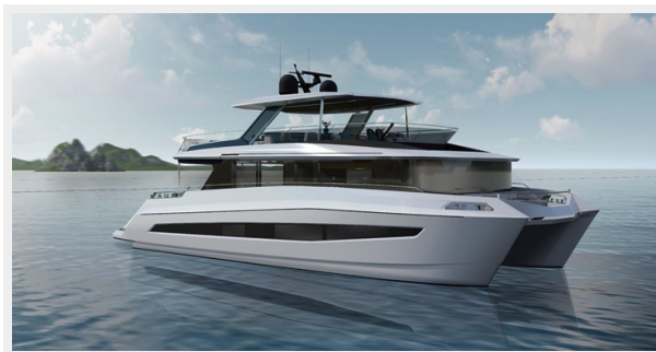
Xcel 70 perspective 1