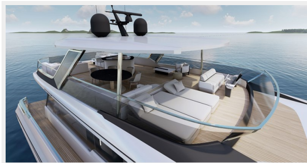
Xcel 70 Flybridge 1