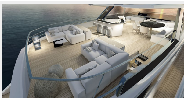
Xcel 70 Flybridge 2