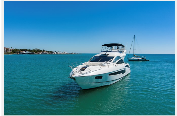
R.F007 - Copy