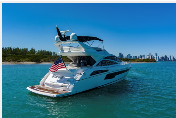
R.F003 - Copy