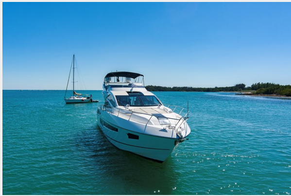
R.F006 - Copy