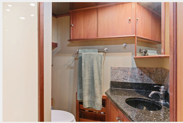
24_2004 57ft Northern Marine 5700 Expedition RAVEN