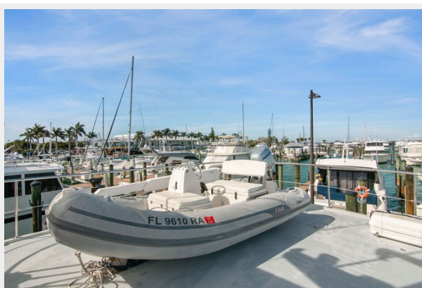
10_2004 57ft Northern Marine 5700 Expedition RAVEN