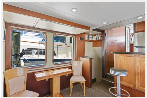
15_2004 57ft Northern Marine 5700 Expedition RAVEN