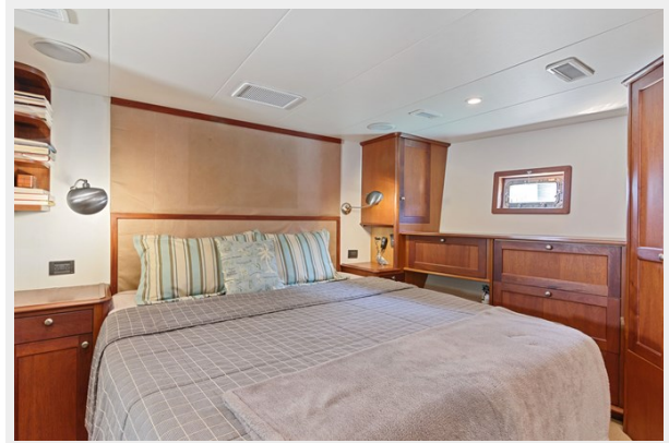
21_2004 57ft Northern Marine 5700 Expedition RAVEN