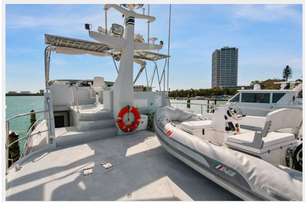
9_2004 57ft Northern Marine 5700 Expedition RAVEN