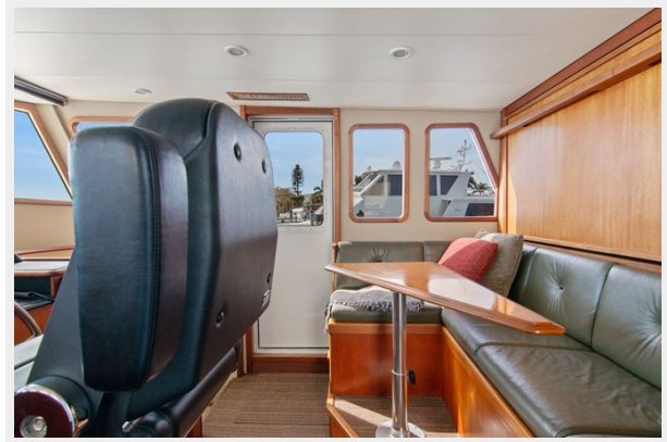
19_2004 57ft Northern Marine 5700 Expedition RAVEN