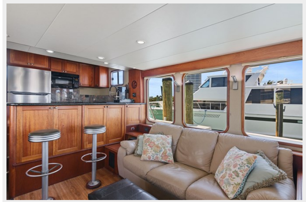
13_2004 57ft Northern Marine 5700 Expedition RAVEN