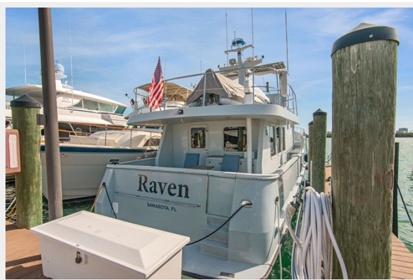
4_2004 57ft Northern Marine 5700 Expedition RAVEN