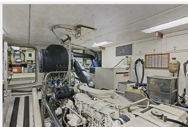
28_2004 57ft Northern Marine 5700 Expedition RAVEN