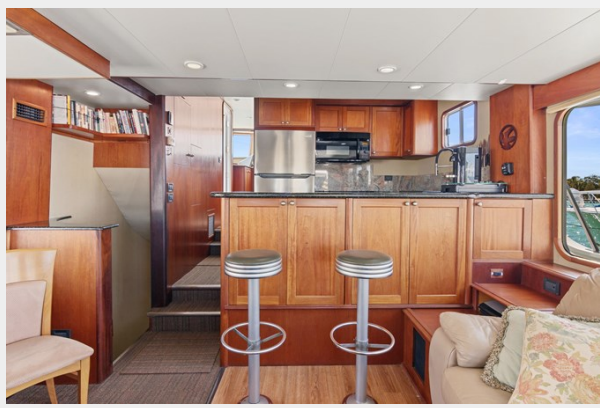
14_2004 57ft Northern Marine 5700 Expedition RAVEN