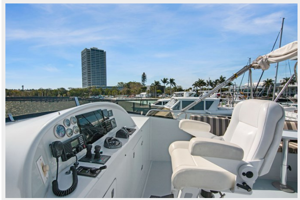
7_2004 57ft Northern Marine 5700 Expedition RAVEN