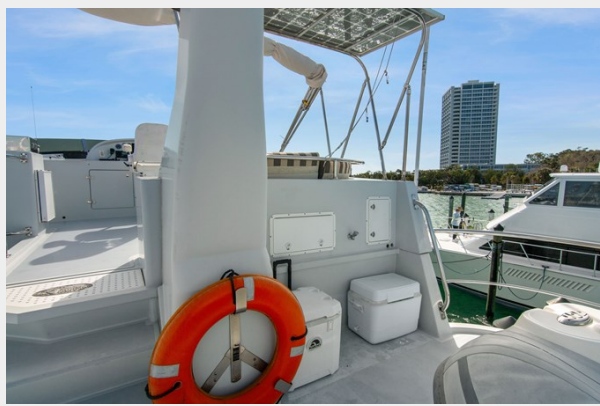
8_2004 57ft Northern Marine 5700 Expedition RAVEN