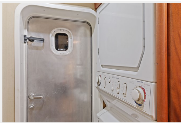
26_2004 57ft Northern Marine 5700 Expedition RAVEN