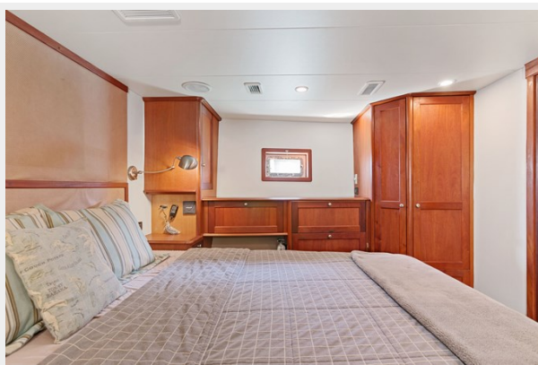
22_2004 57ft Northern Marine 5700 Expedition RAVEN