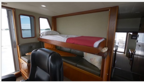
20_2004 57ft Northern Marine 5700 Expedition RAVEN