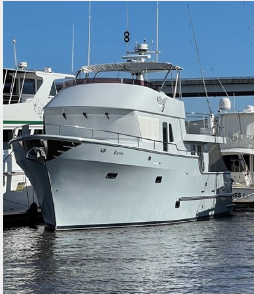
2_2004 57ft Northern Marine 5700 Expedition RAVEN