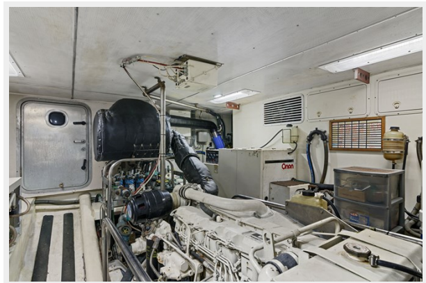
27_2004 57ft Northern Marine 5700 Expedition RAVEN