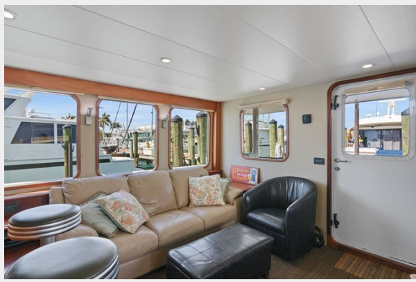
12_2004 57ft Northern Marine 5700 Expedition RAVEN