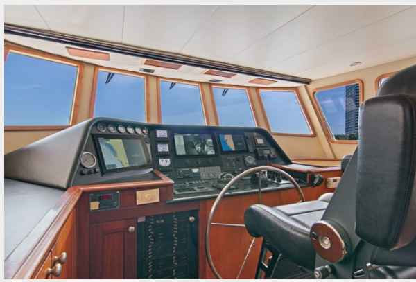
18_2004 57ft Northern Marine 5700 Expedition RAVEN