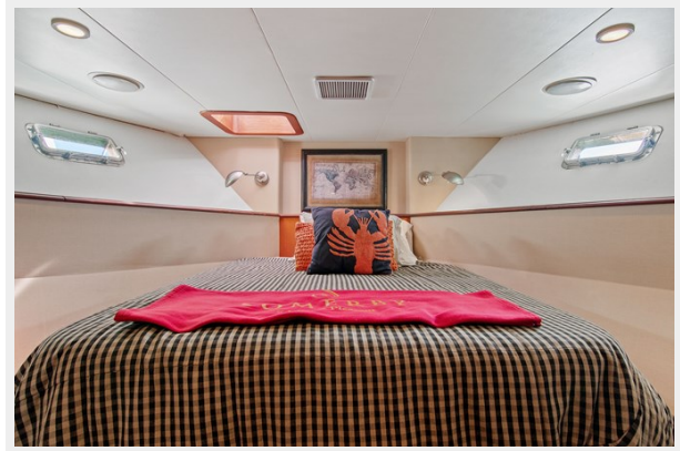
25_2004 57ft Northern Marine 5700 Expedition RAVEN