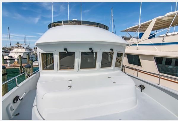
6_2004 57ft Northern Marine 5700 Expedition RAVEN