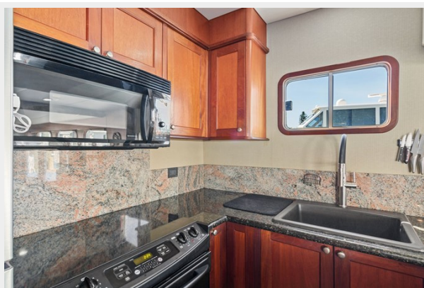
16_2004 57ft Northern Marine 5700 Expedition RAVEN