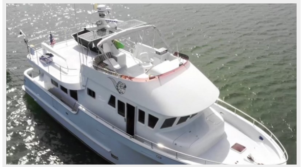
3_2004 57ft Northern Marine 5700 Expedition RAVEN