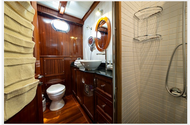
Queen of Datca Fwd Master Cabin 02