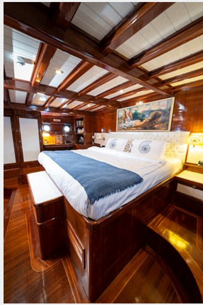
Queen of Datca Aft Master 03