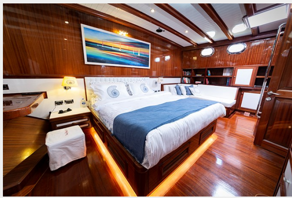
Queen of Datca Fwd Master Cabin 01