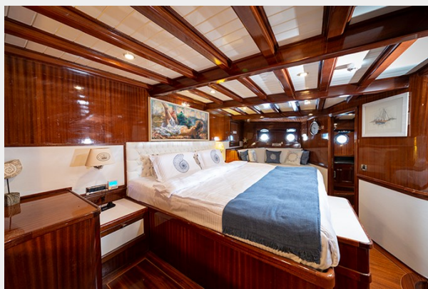
Queen of Datca Aft Master 01