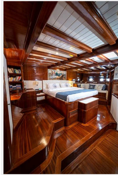
Queen of Datca Aft Master 04