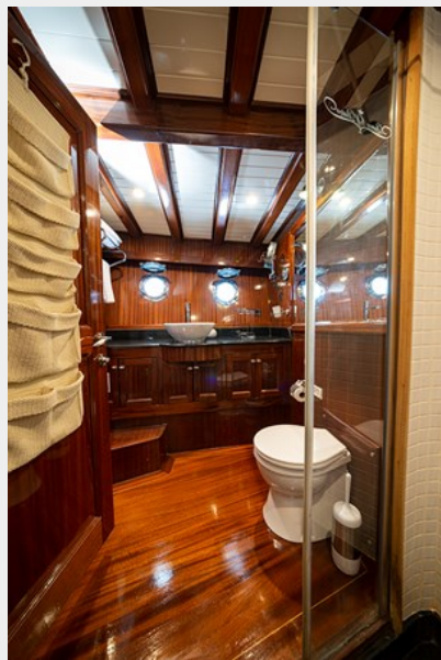
Queen of Datca Aft Master Bathroom 01