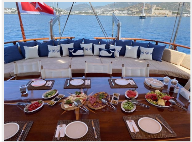
Queen of Datca Aft Deck Table 03