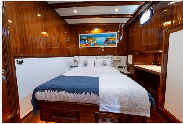
Queen of Datca Double Cabin 01