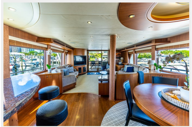
Dining, Port Starboard