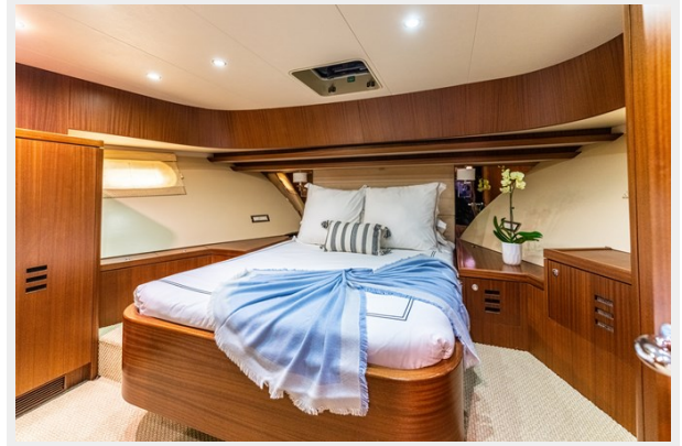
Queen Guest Stateroom, Bow