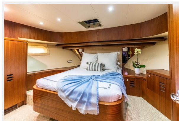
Queen Guest Stateroom, Bow