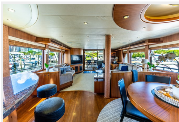
Dining, Port Starboard