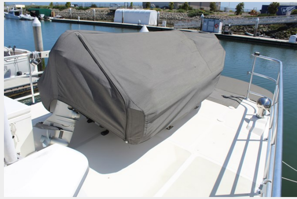
Boat deck and tender