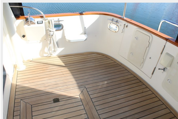
Aft deck with lazette hatch