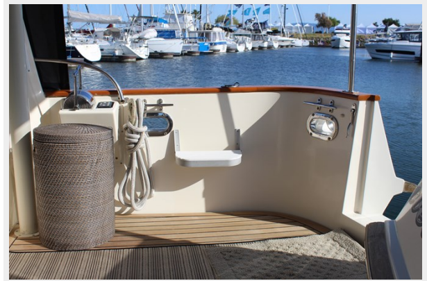
Drop-down entry step