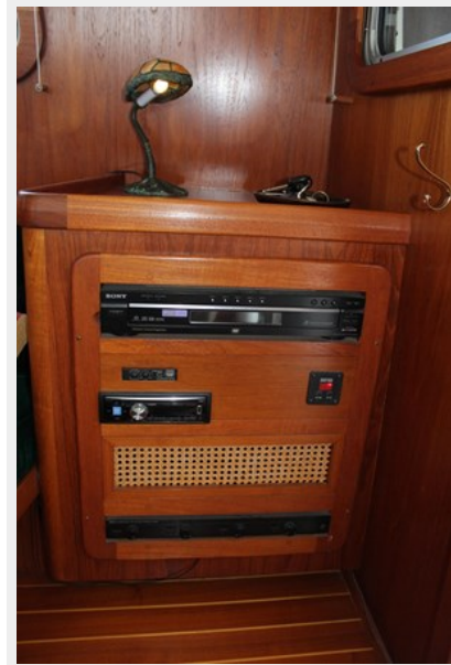
Salon entertainment center