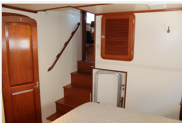
Companionway from master to salon