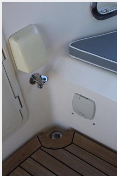
Fresh water aft deck washdown