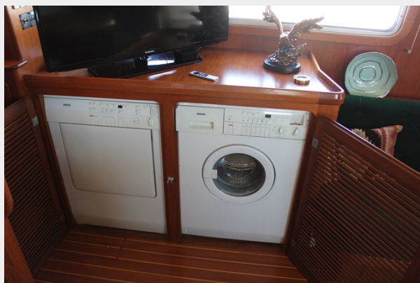
Incredibly convenient Bosch washer & dryer