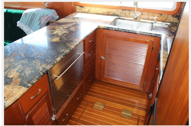
Ample stowage. Dishwasher