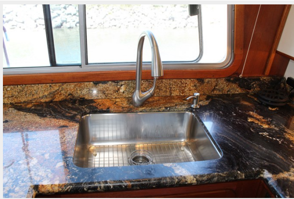
large S/S sink. Opening port