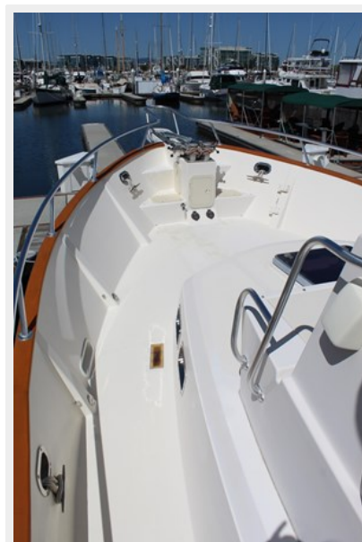
High, safe bulwarks