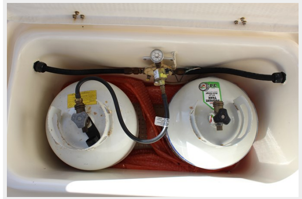
Propane tank stowage locker