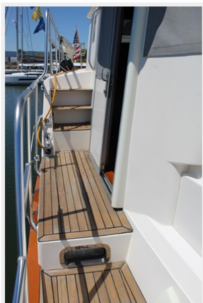
Teak side decks