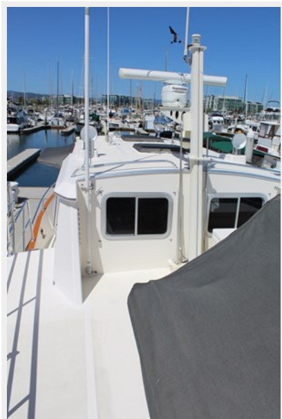
Aft pilot house windows