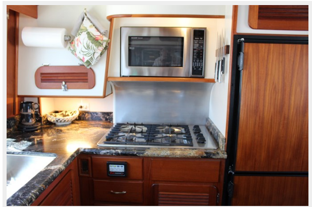
Gas range with convection/microwave above