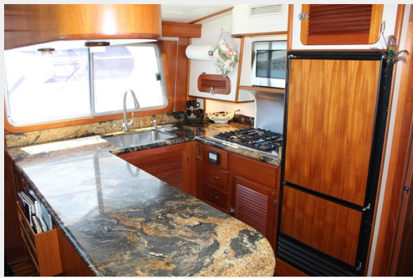
Custom marble countertops