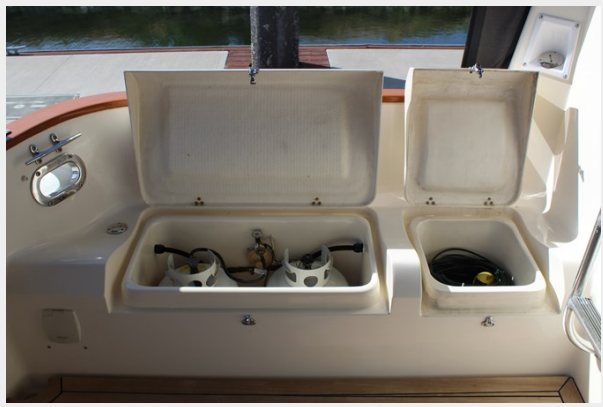
Under bench stowage