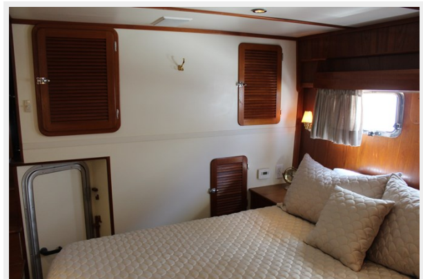
Master engine room access