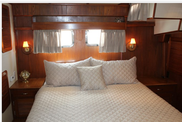
Master, facing port. Note large ports.