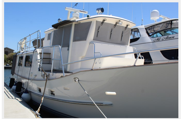
Formidable anchoring set-up