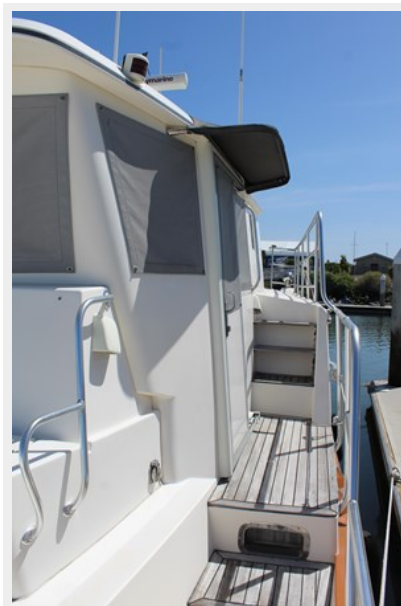
Heading aft, port side