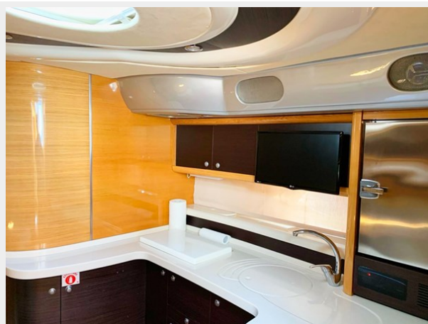
Cranchi 50 - GINGER 19