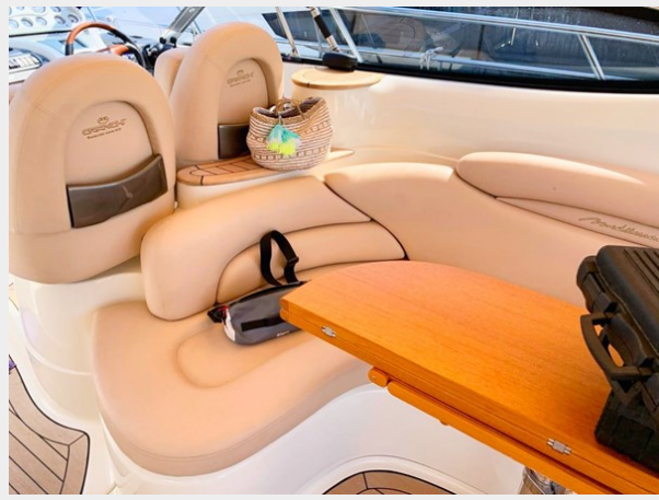
Cranchi 50 - GINGER 15