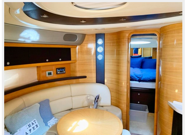
Cranchi 50 - GINGER 18