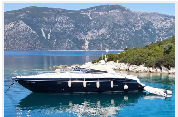
Cranchi 50 - GINGER 4