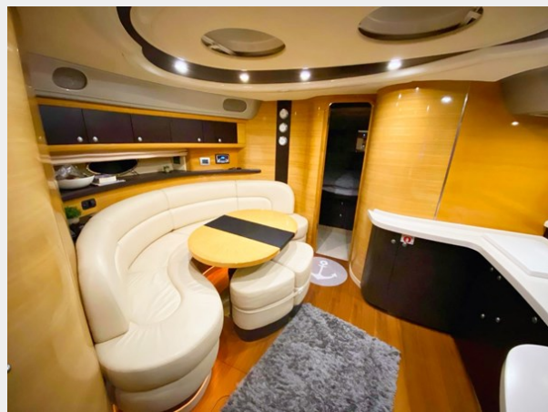
Cranchi 50 - GINGER 17