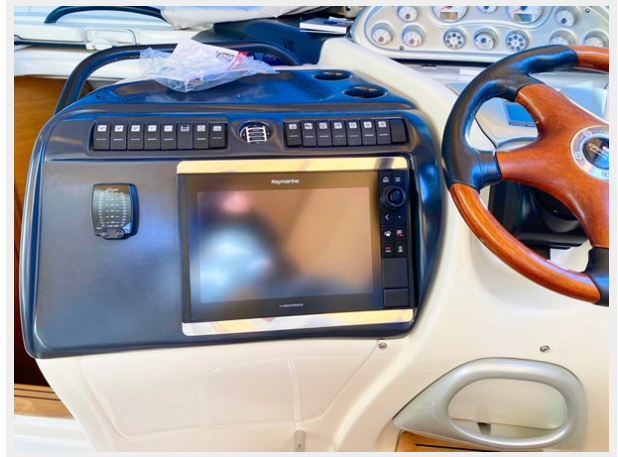
Cranchi 50 - GINGER 16