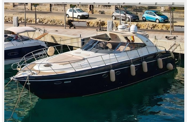
Cranchi 50 - GINGER 2