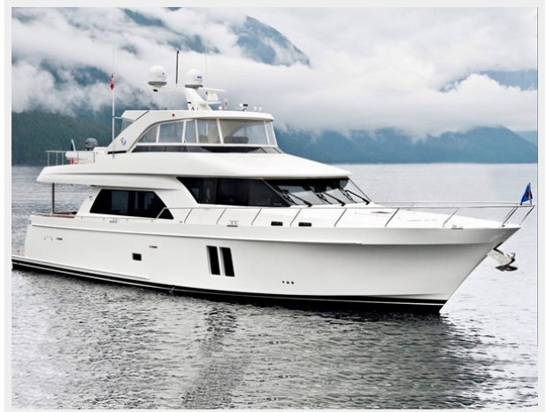
Starboard Bow Profile