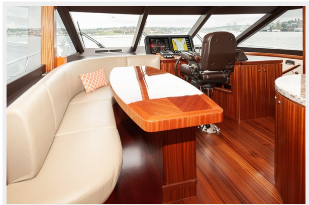
Dinette / Pilothouse