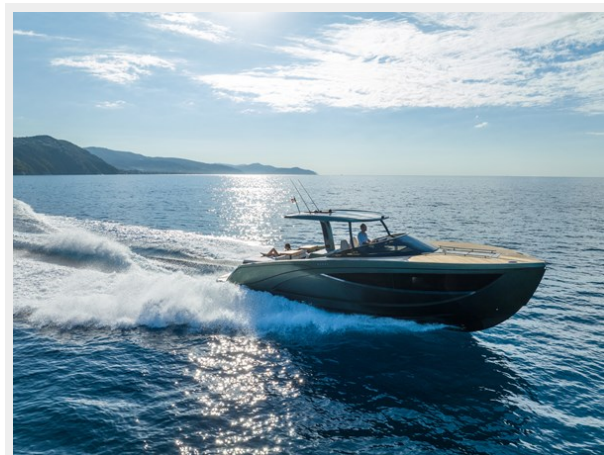
NY40 PROFILE RUNNING 3