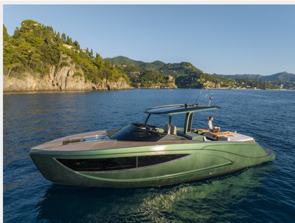
NY40 AERIAL PROFILE 2