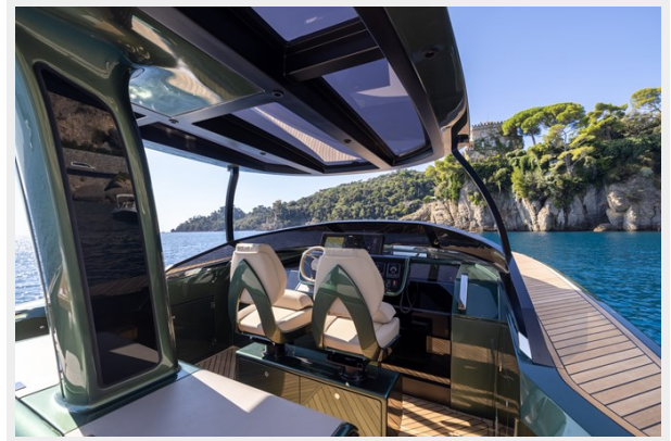
NY40 COCKPIT 2