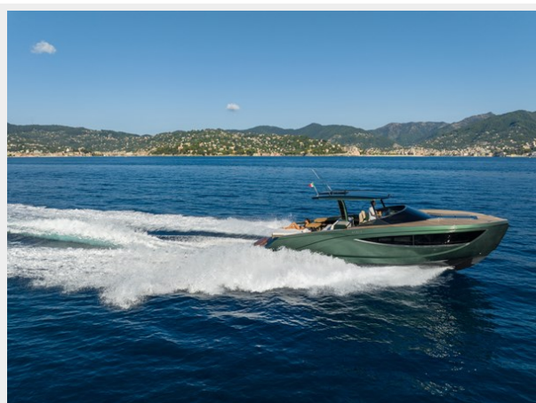
NY40 PROFILE RUNNING 4