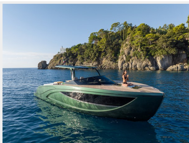
NY40 LIFESTYLE BOW 2