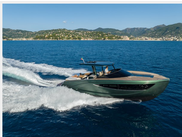
NY40 PROFILE RUNNING 2