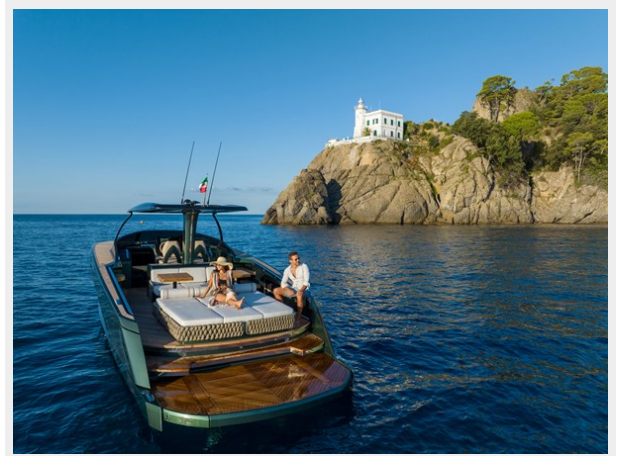
NY40 LIFESTYLE AT ANCHOR