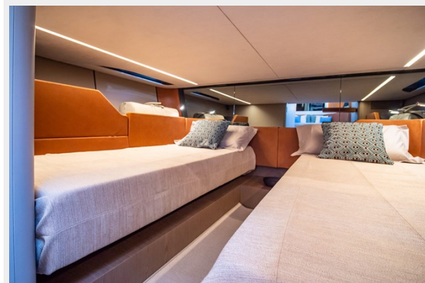
NY40 MID CABIN