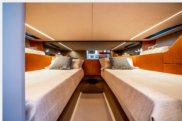
NY40 MID CABIN 2