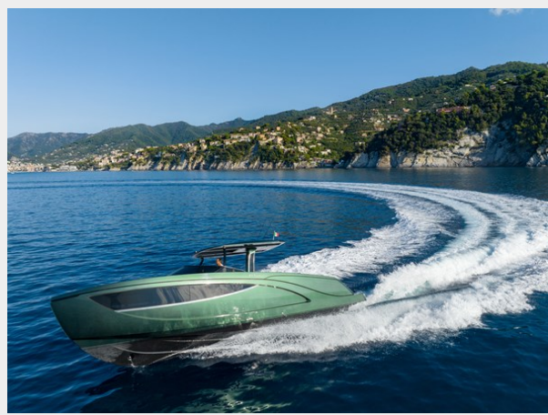
NY40 INTO THE TURN