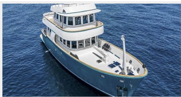
T85 sistership picture 1