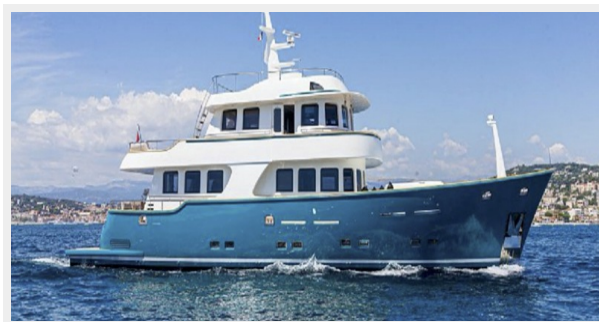
T85 sistership picture