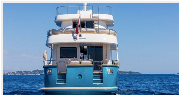
T85 sistership picture 3