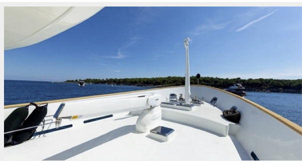
T85 sistership picture 6