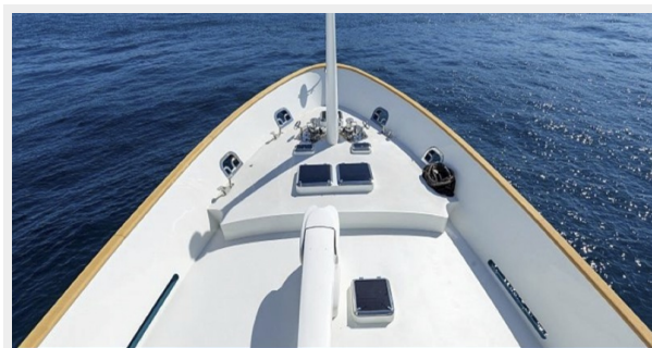
T85 sistership picture 5