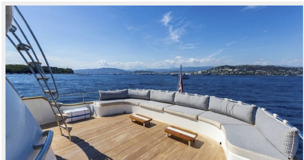
T85 sistership picture 8