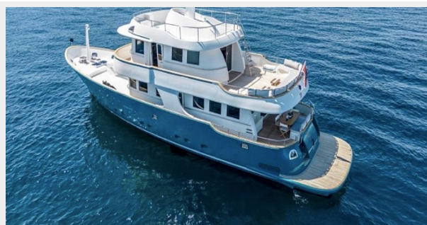
T85 sistership picture 2