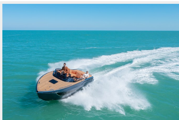
NEREA NY24 INTO THE TURN