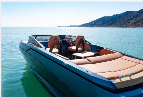
NEREA NY24 STERN PROFILE