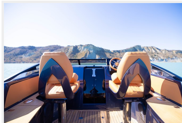
NEREA NY24 COCKPIT