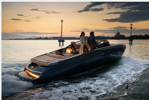
NEREA NY24 EVENING 2