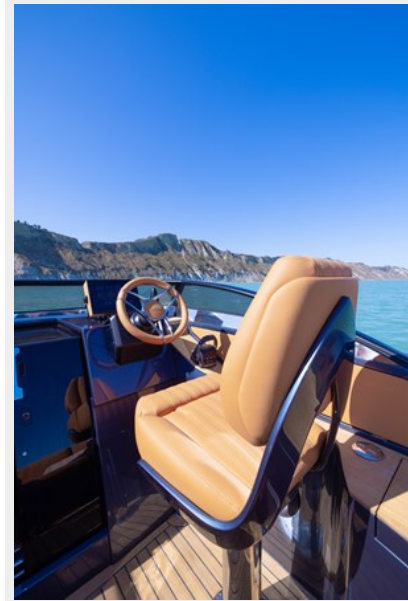
NEREA NY24 HELM