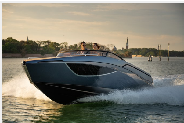
NEREA NY24 RUNNING PROFILE