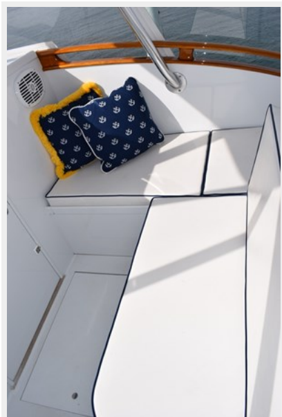
Bridge Deck Seating Forward