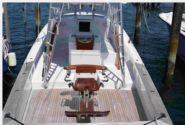
Cockpit Forward View