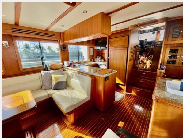
2005 Selene 53 (ASANTE) Saloon