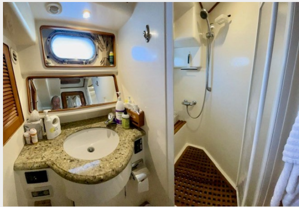
2005 Selene 53 (ASANTE) Owner Head & Shower