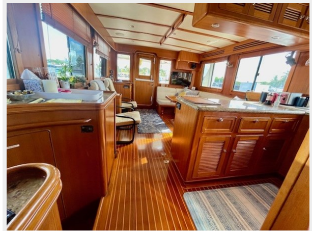
2005 Selene 53 (ASANTE) Saloon_2