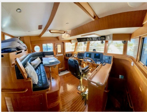
2005 Selene 53 (ASANTE) Wheelhouse