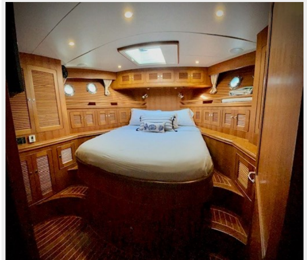
2005 Selene 53 (ASANTE) VIP Stateroom