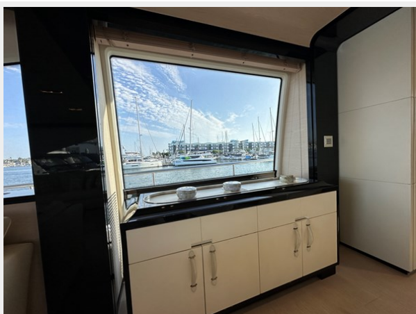
14_2015 82ft Azimut Flybridge SLINGSHOT