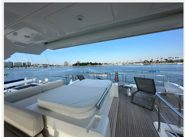
47_2015 82ft Azimut Flybridge SLINGSHOT