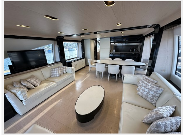
11_2015 82ft Azimut Flybridge SLINGSHOT