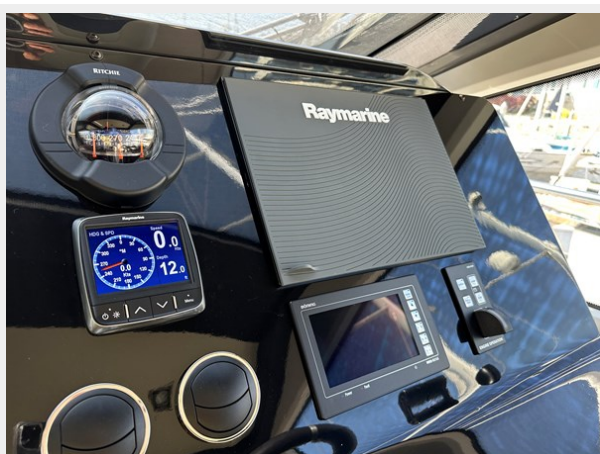
20_2015 82ft Azimut Flybridge SLINGSHOT