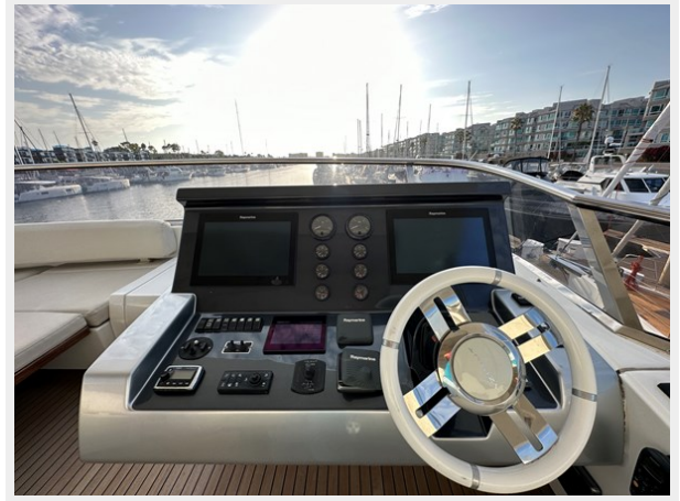
51_2015 82ft Azimut Flybridge SLINGSHOT