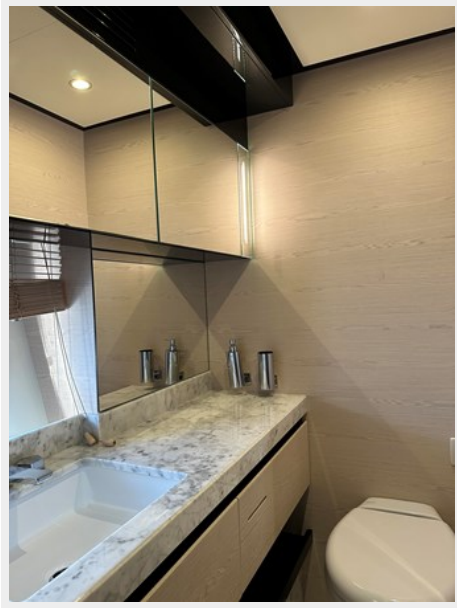
44_2015 82ft Azimut Flybridge SLINGSHOT