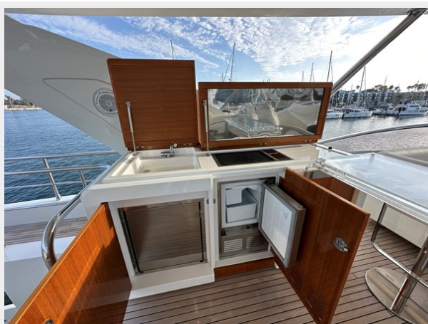
48_2015 82ft Azimut Flybridge SLINGSHOT