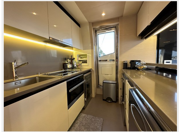
17_2015 82ft Azimut Flybridge SLINGSHOT