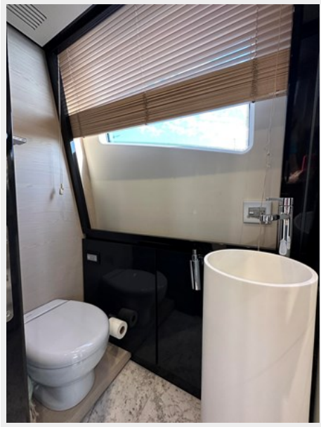
26_2015 82ft Azimut Flybridge SLINGSHOT