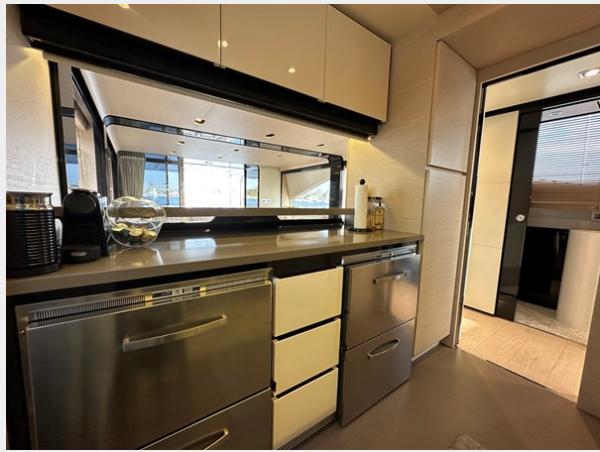
16_2015 82ft Azimut Flybridge SLINGSHOT