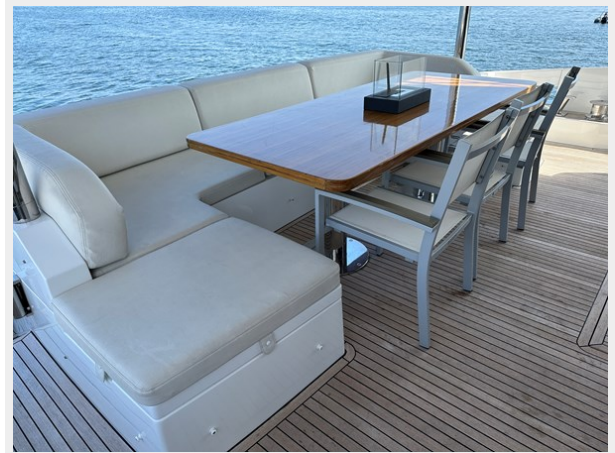
3_2015 82ft Azimut Flybridge SLINGSHOT