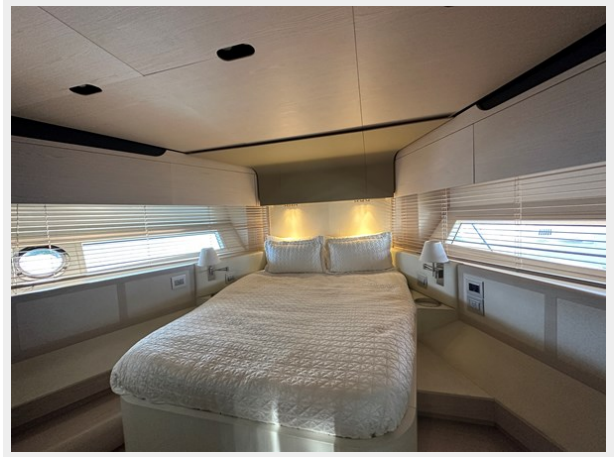
40_2015 82ft Azimut Flybridge SLINGSHOT 41_2015 82ft Azimut Flybridge SLINGSHOT