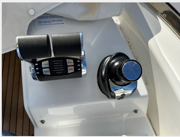
52_2015 82ft Azimut Flybridge SLINGSHOT