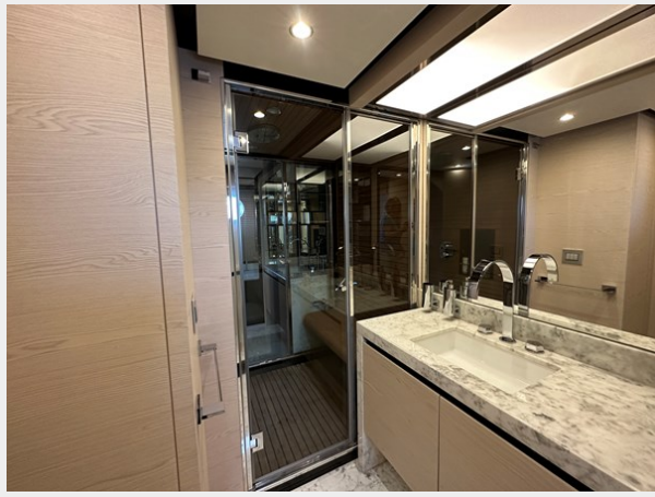
32_2015 82ft Azimut Flybridge SLINGSHOT