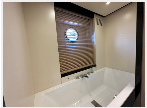
35_2015 82ft Azimut Flybridge SLINGSHOT