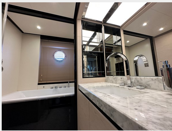
36_2015 82ft Azimut Flybridge SLINGSHOT