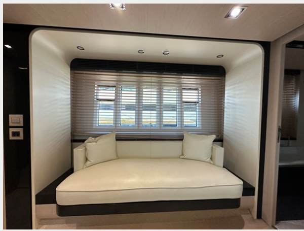
34_2015 82ft Azimut Flybridge SLINGSHOT