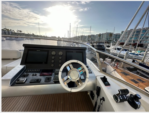
50_2015 82ft Azimut Flybridge SLINGSHOT