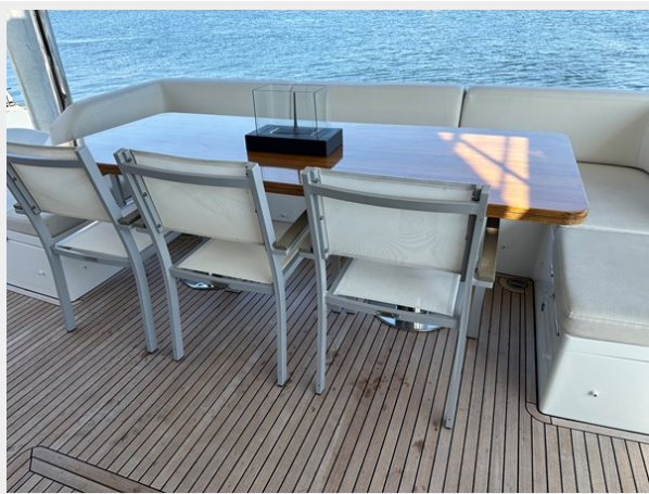
4_2015 82ft Azimut Flybridge SLINGSHOT