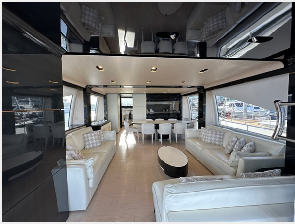
10_2015 82ft Azimut Flybridge SLINGSHOT