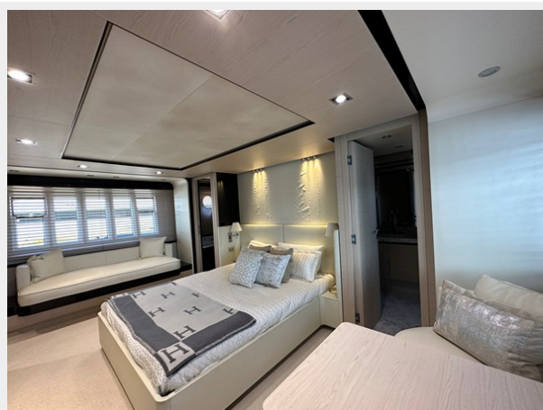
30_2015 82ft Azimut Flybridge SLINGSHOT