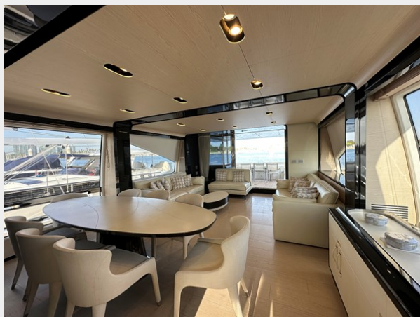
12_2015 82ft Azimut Flybridge SLINGSHOT