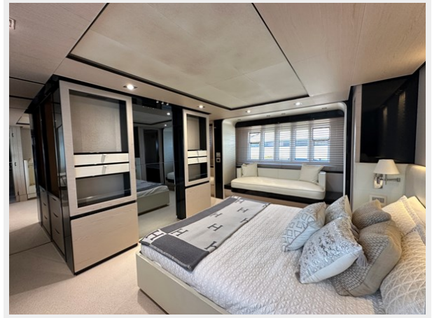
33_2015 82ft Azimut Flybridge SLINGSHOT