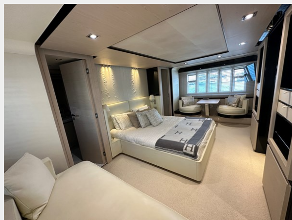
28_2015 82ft Azimut Flybridge SLINGSHOT