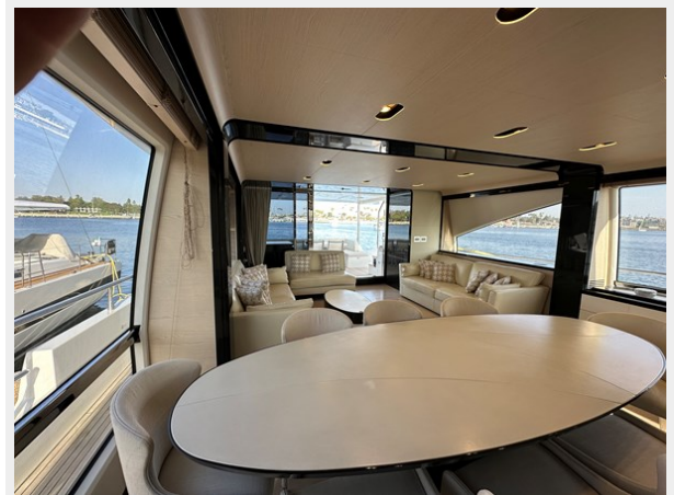
13_2015 82ft Azimut Flybridge SLINGSHOT