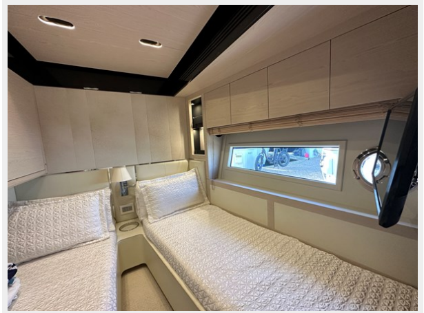
42_2015 82ft Azimut Flybridge SLINGSHOT 43_2015 82ft Azimut Flybridge SLINGSHOT