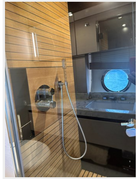
45_2015 82ft Azimut Flybridge SLINGSHOT