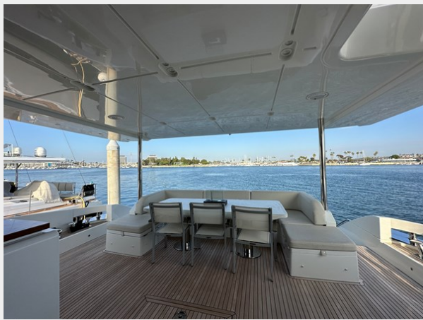
2_2015 82ft Azimut Flybridge SLINGSHOT