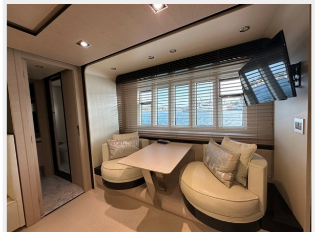
29_2015 82ft Azimut Flybridge SLINGSHOT