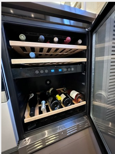
18_2015 82ft Azimut Flybridge SLINGSHOT