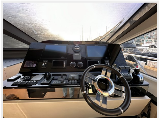
19_2015 82ft Azimut Flybridge SLINGSHOT