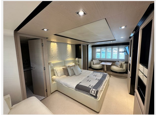
27_2015 82ft Azimut Flybridge SLINGSHOT