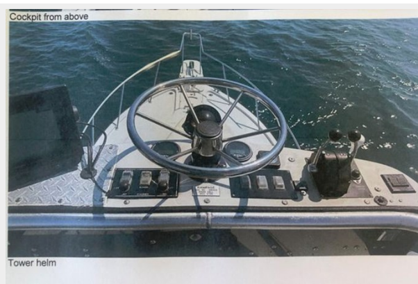
mail - 2024-04-11T113251.573