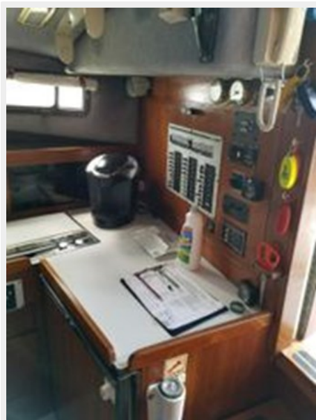
mail - 2024-04-11T113130.227