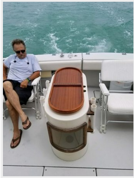
mail - 2024-04-11T113244.012