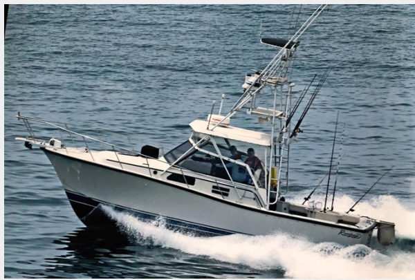
mail - 2024-04-11T113123.259