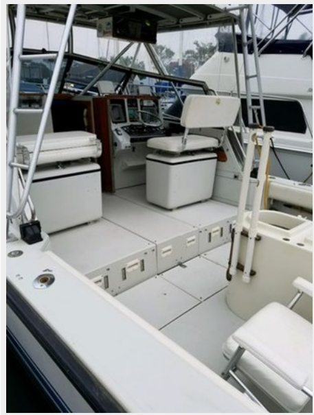
mail - 2024-04-11T113226.619