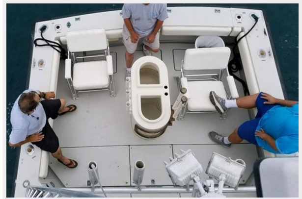
mail - 2024-04-11T113247.992