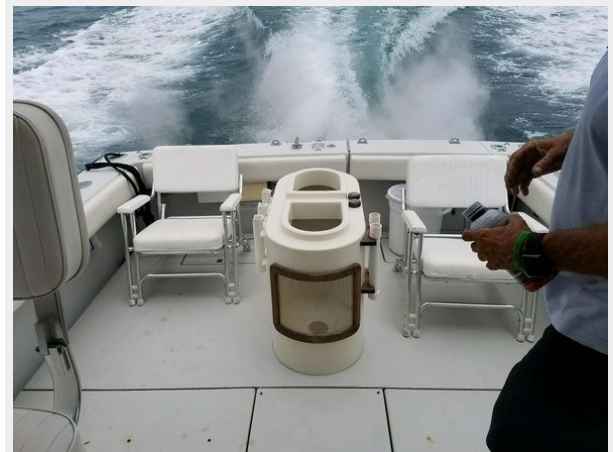
mail - 2024-04-11T113230.760