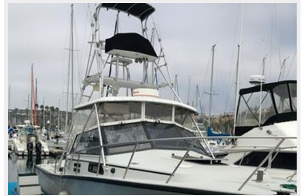
mail - 2024-04-11T113126.787