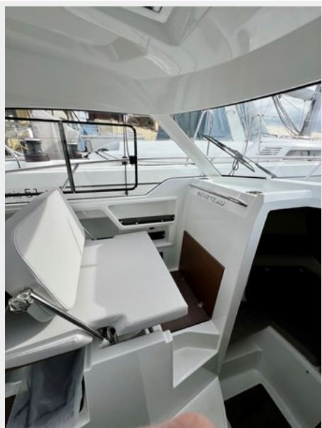
IMG_5860 Large (1)