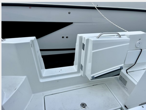
IMG_5843 Large (1)