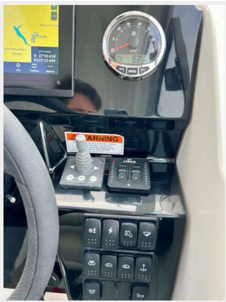
IMG_5849 Large (1)