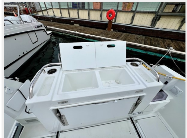
IMG_5861 Large (1)