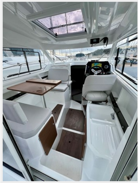
IMG_5844 Large (1)