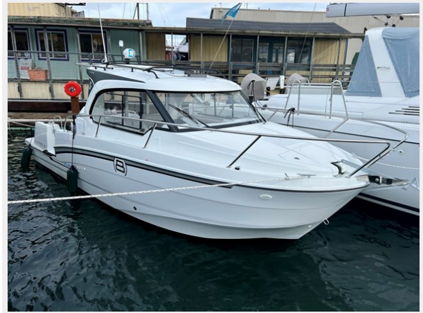
IMG_5841 Large (1)