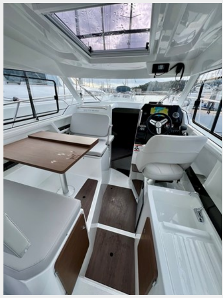
IMG_5855 Large (1)