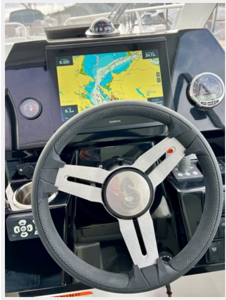
IMG_5848 Large (1)