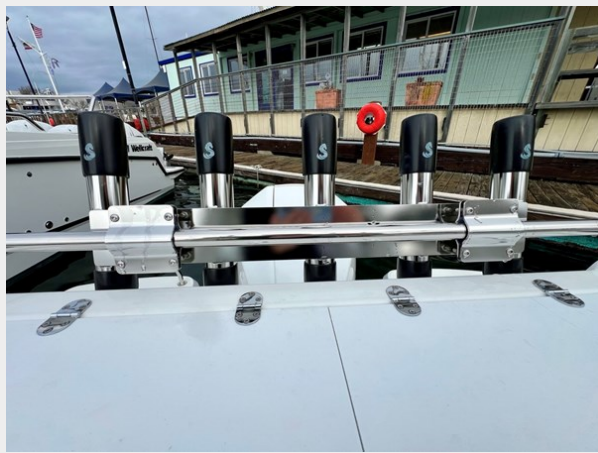
IMG_5862 Large (1)