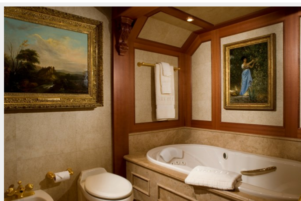
Hers - Master Bath