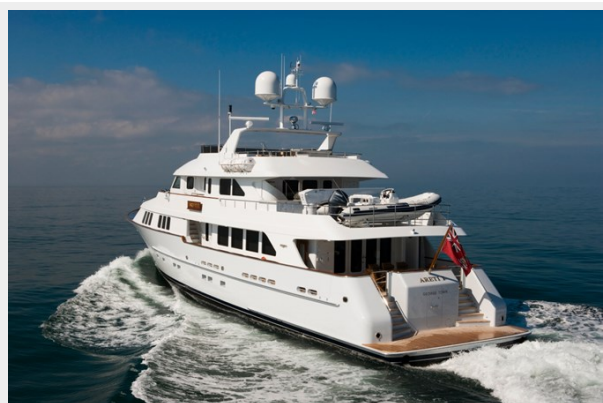
Running - Port Aft