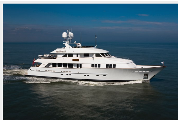
Running - Stbd Profile