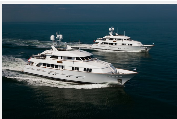
Twins - ARETI I and ARETI II - Port