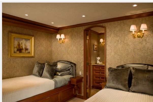
Guest - Port Twin