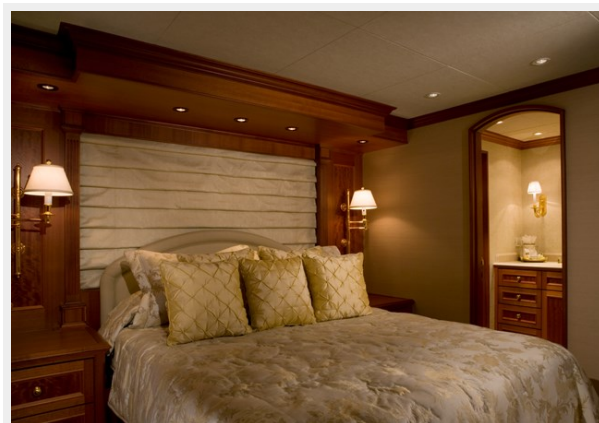
Guest - Stbd Queen