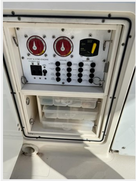
12_2009 31ft Pursuit S310 RELENTLESS