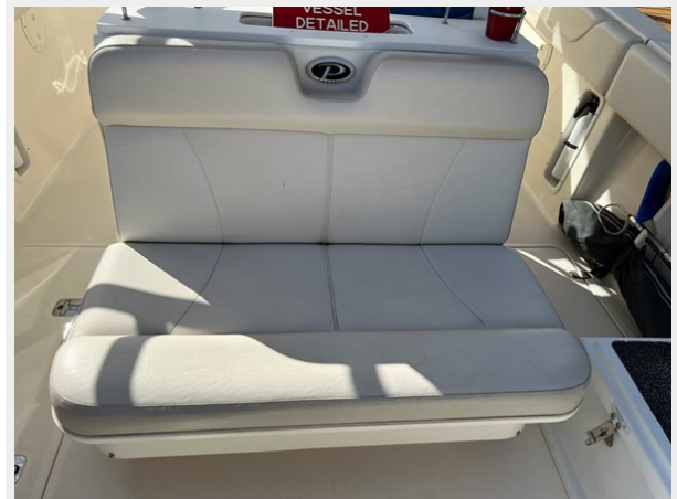
13_2009 31ft Pursuit S310 RELENTLESS