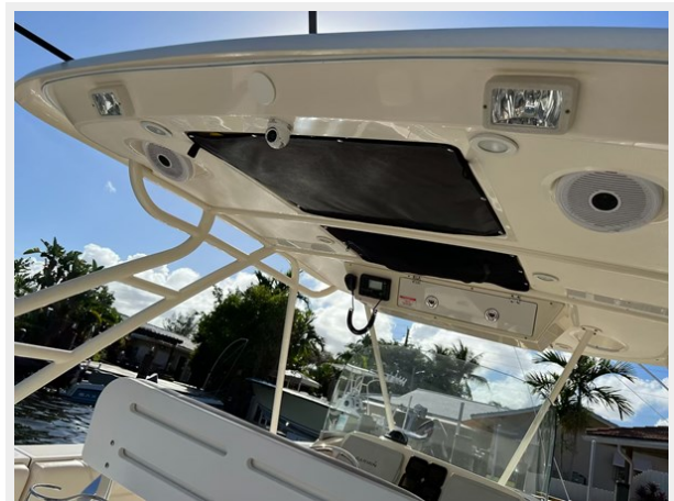
15_2009 31ft Pursuit S310 RELENTLESS