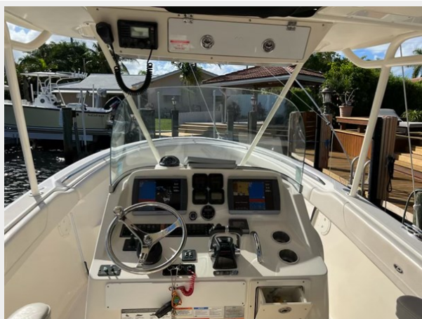
8_2009 31ft Pursuit S310 RELENTLESS