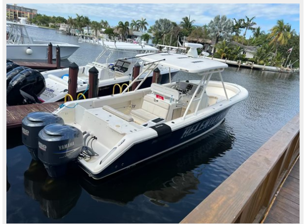
3_2009 31ft Pursuit S310 RELENTLESS