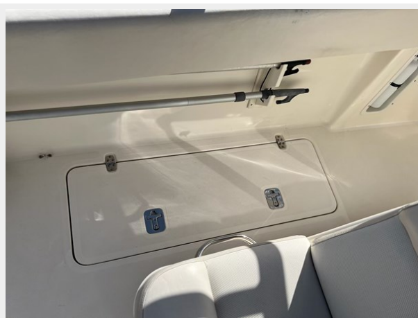
14_2009 31ft Pursuit S310 RELENTLESS