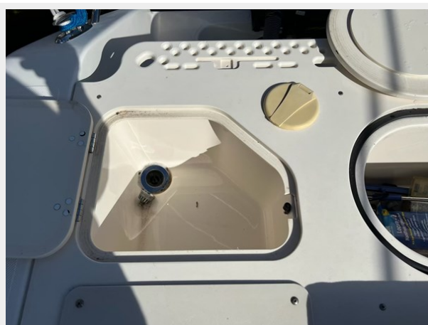
16_2009 31ft Pursuit S310 RELENTLESS