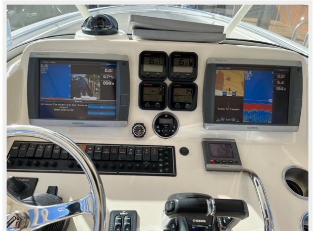
9_2009 31ft Pursuit S310 RELENTLESS