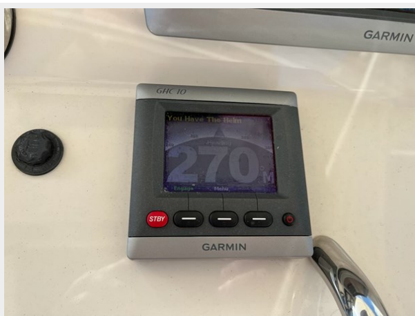
10_2009 31ft Pursuit S310 RELENTLESS