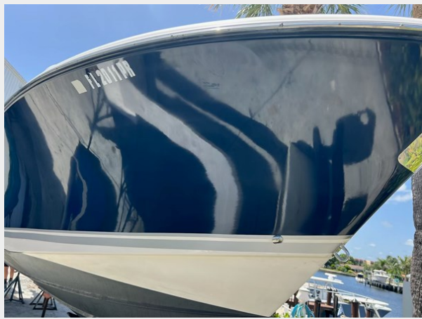
6_2009 31ft Pursuit S310 RELENTLESS