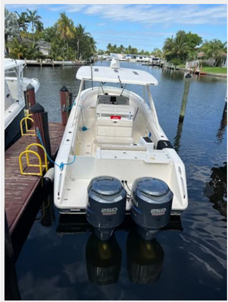
2_2009 31ft Pursuit S310 RELENTLESS