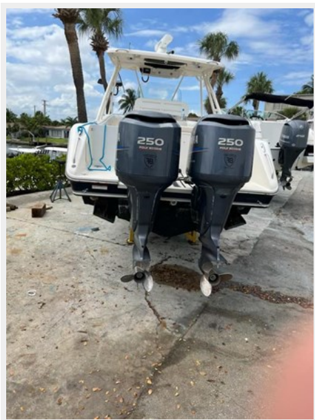
4_2009 31ft Pursuit S310 RELENTLESS