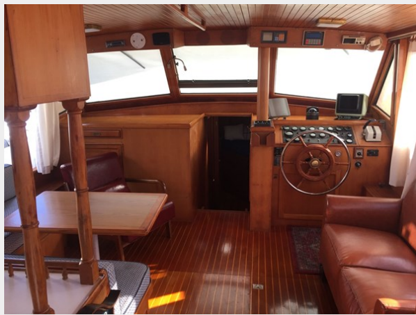
C&L 45 - Looking Forward