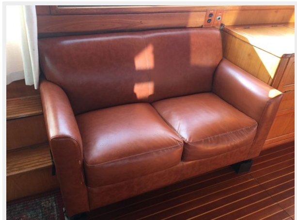
C&L 45 - Salon Couch