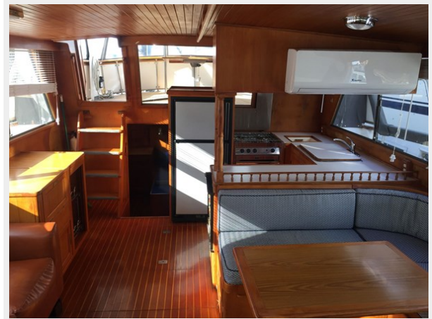
C&L 45 - Looking Aft