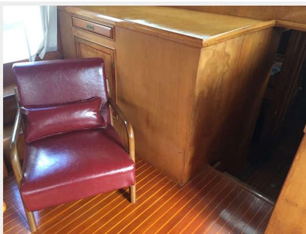
C&L 45 - Salon