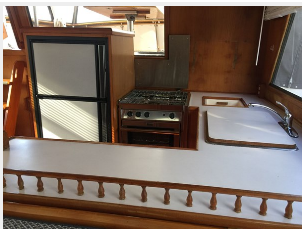
C&L 45 - Galley