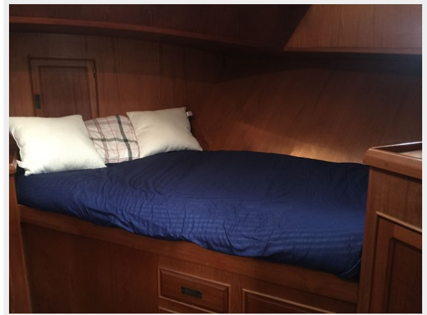
C&L 45 - Forward Cabin