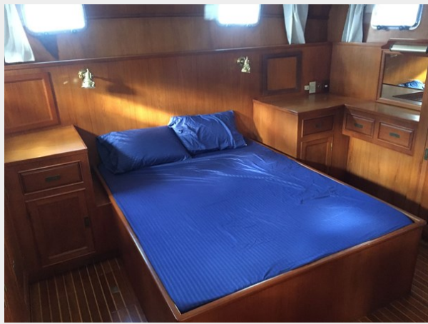
C&L 45 - Aft Cabin