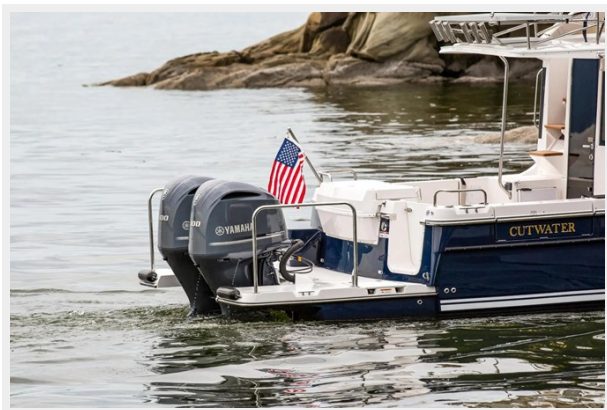
2025 Cutwater 30 Cammand Bridge 2025 Cutwater 30 Cammand Bridge