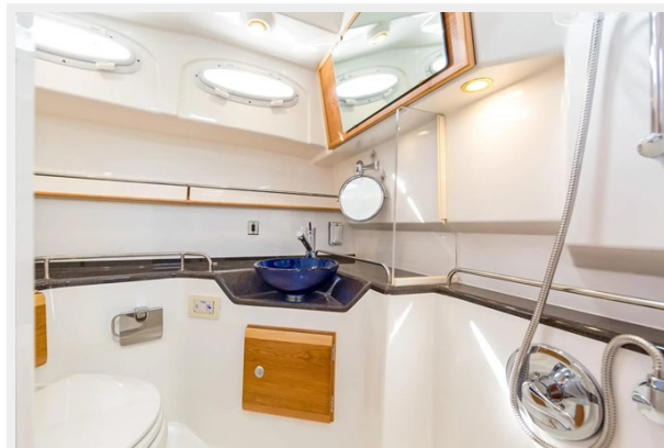
2025 Cutwater 30 Cammand Bridge