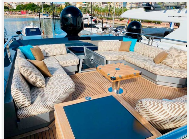
Palmer-Johnson-PJ120-Escape II-Motor Yacht-Exterior-Flybridge