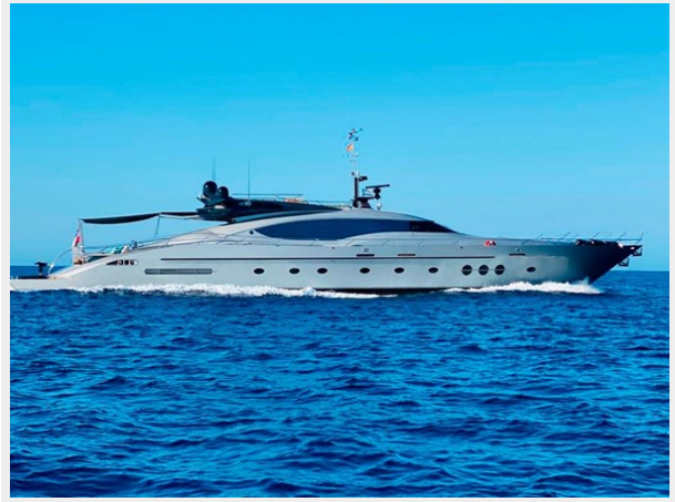
Palmer-Johnson-PJ120-Escape II-Motor Yacht-Exterior-2