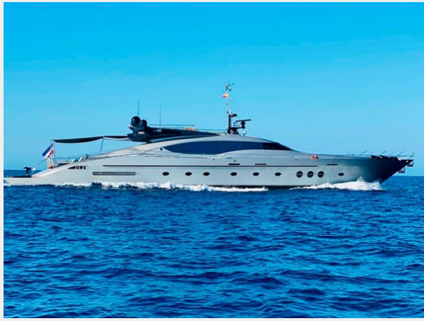
Palmer-Johnson-PJ120-Escape II-Motor Yacht-Exterior-5