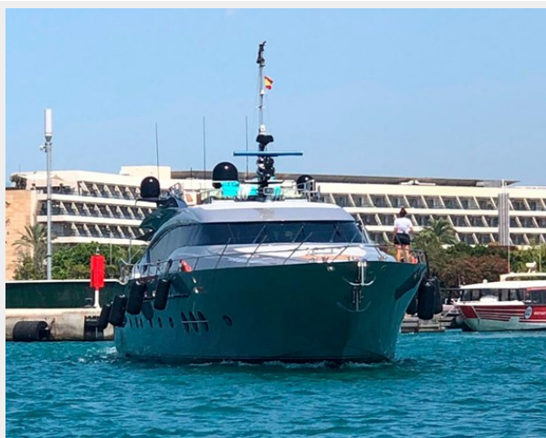
Palmer-Johnson-PJ120-Escape II-Motor Yacht-Bow-View-2