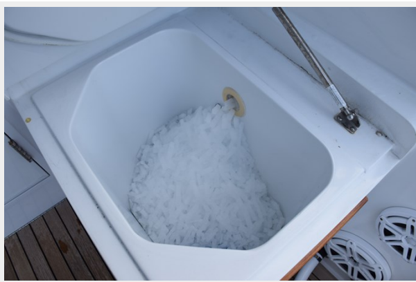
Eskimo Ice Storage Bin