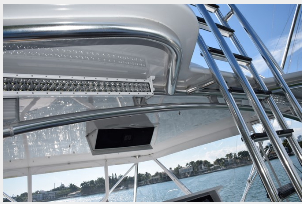
Aft Facing Lightbars