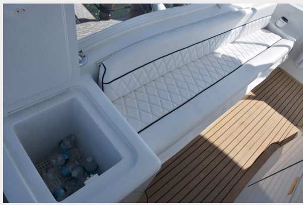
Bentley Stitch Bridge Cushions, Flybridge Drink Box