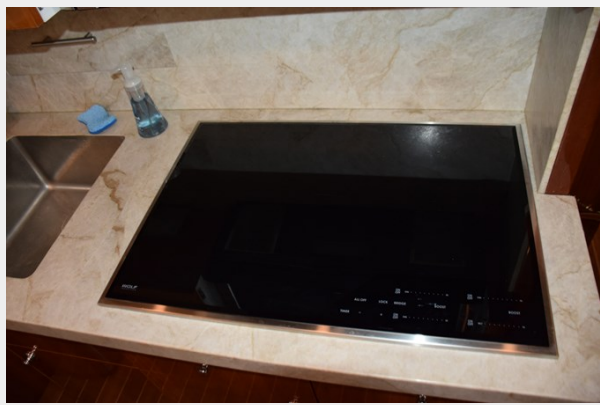
Wolf Induction Stovetop