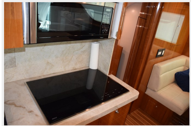
Microwave Convention Behind Cabinet Above Stovetop