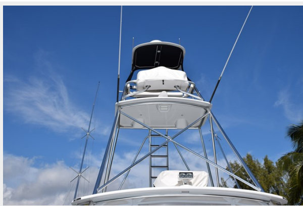
Pipewelders Full Tower with Center Ladder and Blacked Out Tower Station