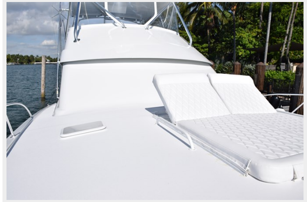
Bow Chaise Loungers