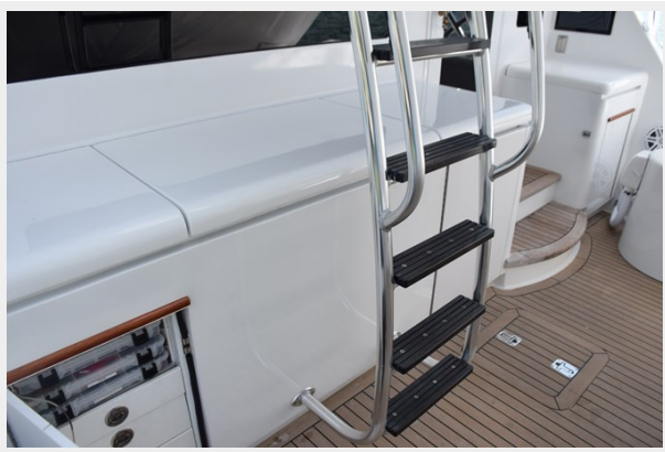
Tackle Drawers in Console and Ladder to Flybridge