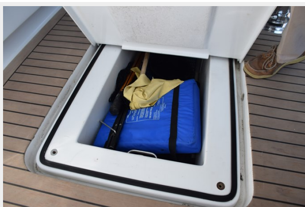
Under Deck Large Fish Box