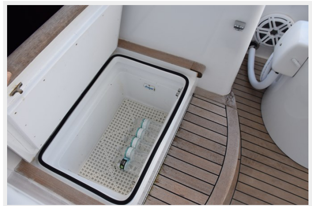
Under Cockpit Step Refrigerated Drink Box