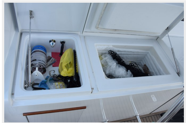
Cockpit Freezer and Rigging Sink