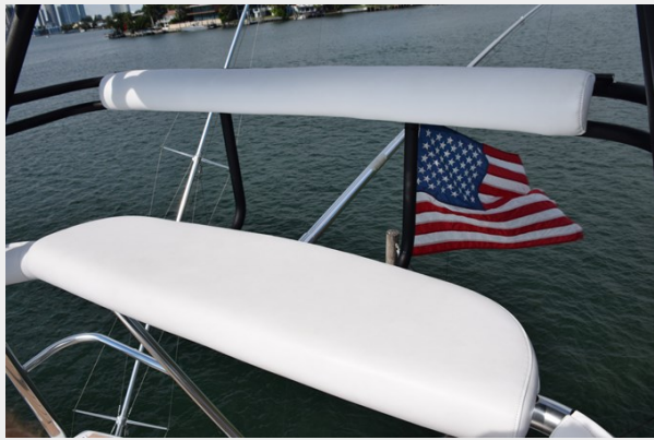
Tower Bench Seat