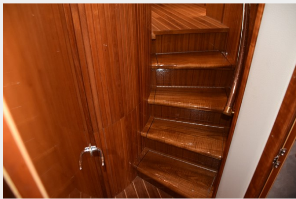
Stairs from Companionway to Salon