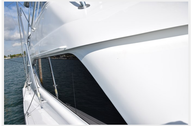
Recent Paint on Deckhouse