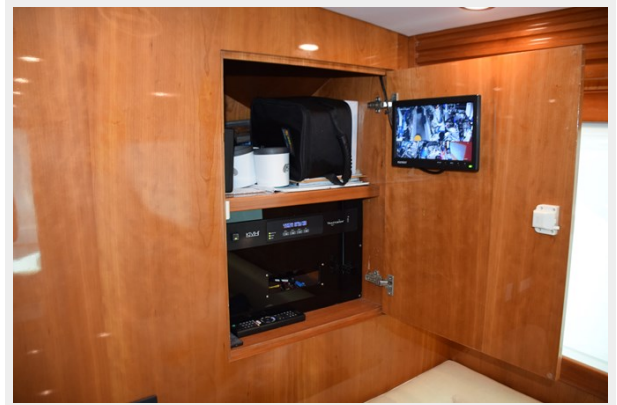
AV Cabinet Forward of Dinette