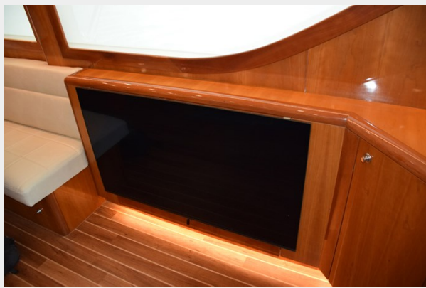
55' Salon Samsung Smart TV