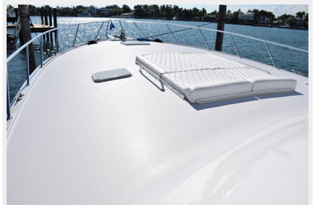
Bow Sunpad, New Bow Railing