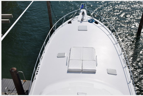
Bow View from Tower