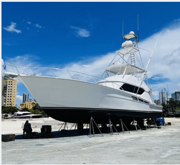
Hauled Out-Bottom Job Done March '24