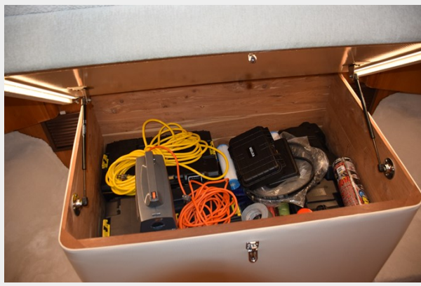
VIP Underberth Storage