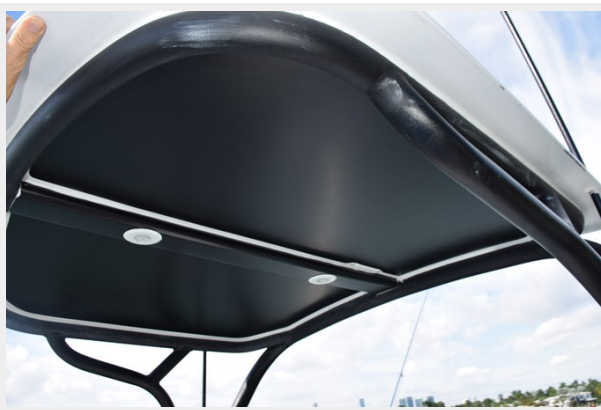
Tower Buggy Top