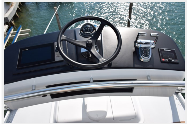
Tower Helm Blacked Out