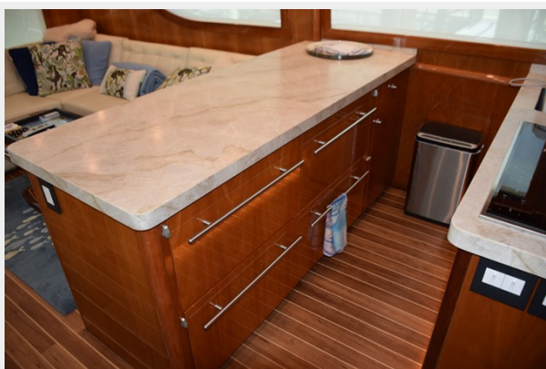
Galley Custom Countertop