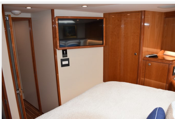
VIP Stateroom 1