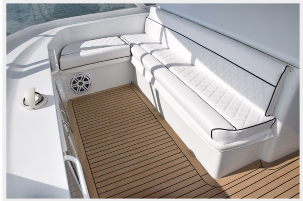
Forward Flybridge Lounge