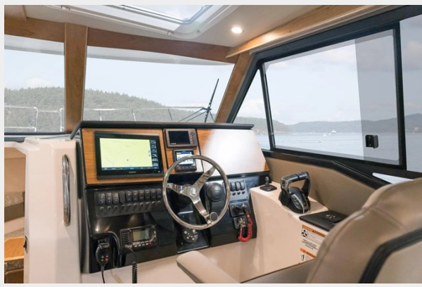
2025 Cutwater 288 Coupe