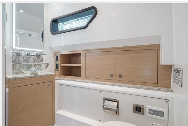
7 head fwd