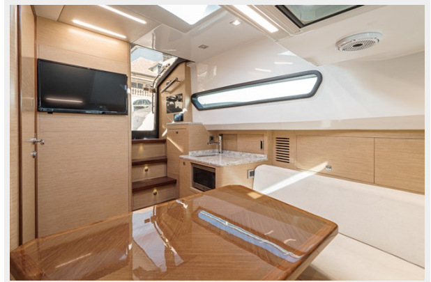
6 cabin fwd