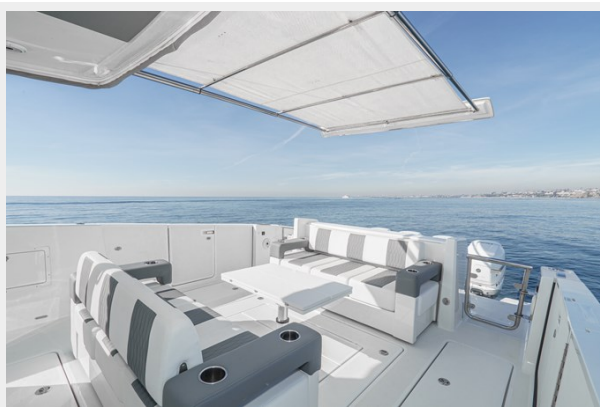
2 aft canopy 2