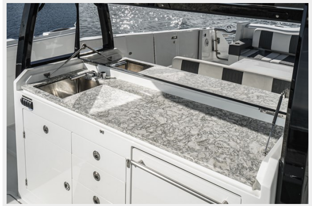
4 galley counter 2