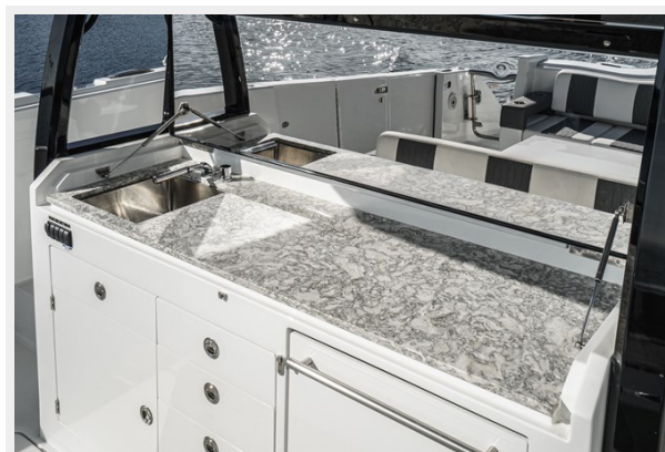
4 galley counter 2