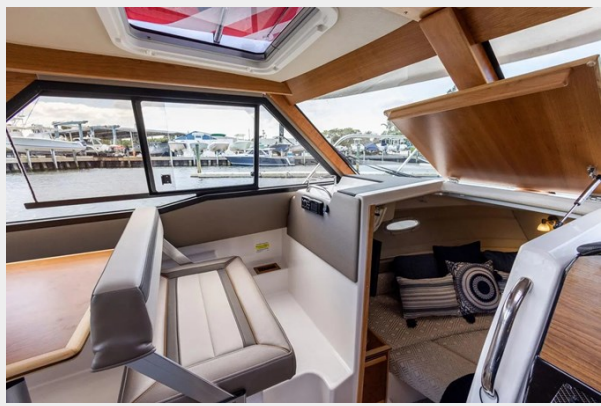
2024 Cutwater 248 Coupe