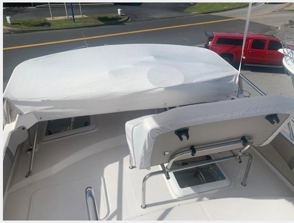
2025 Cutwater 32 Command Bridge Luxury Edition 2025 Cutwater 32 Command Bridge Luxury Edition