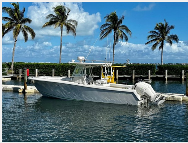
Twin 300 Yamahas