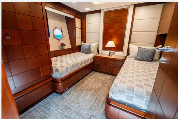
Twin Guest Stateroom, Starboard