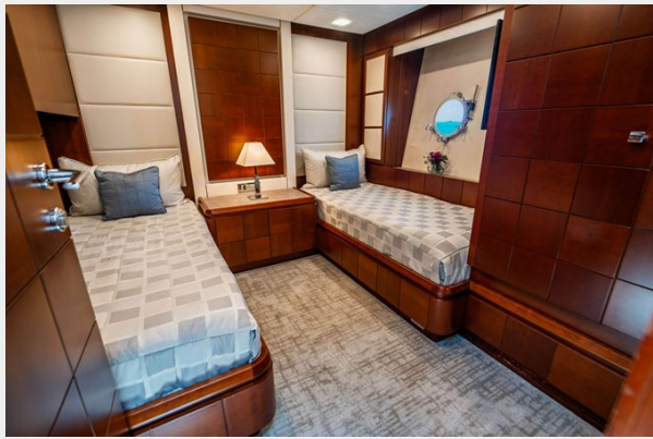
Twin Guest Stateroom, Port