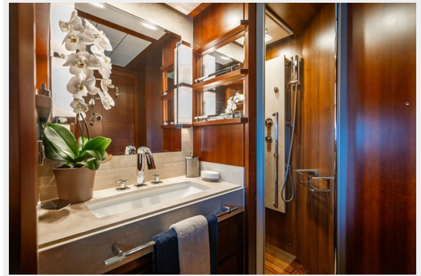
Twin Stateroom Bath, Port