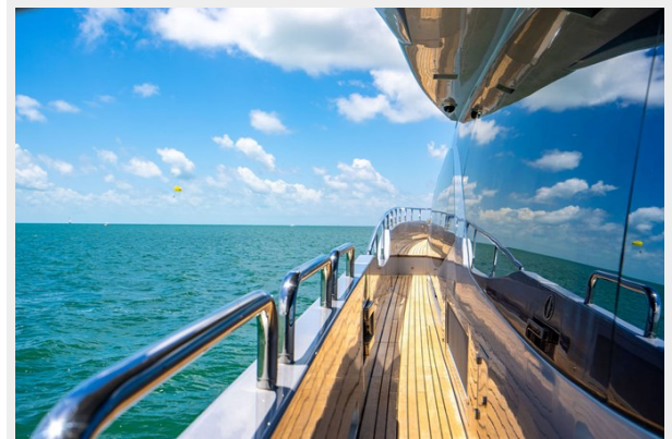
Walk-Around Deck, Port