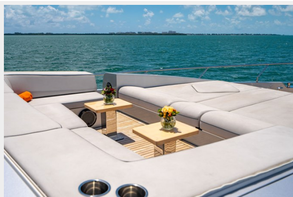
Forward Lounge Seating