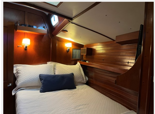
50' Hinckley Sou'wester 1977 (BACCARA) Owner's Stateroom