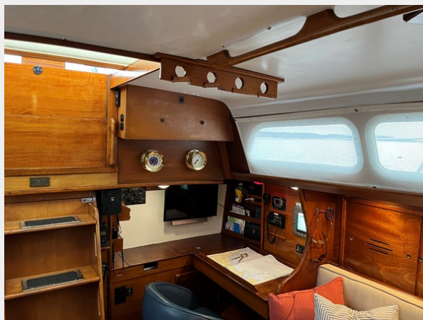
50' Hinckley Sou'wester 1977 (BACCARA) Navigation Station