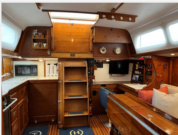
50' Hinckley Sou'wester 1977 (BACCARA) Saloon and Galley