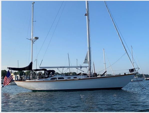
50' Hinckley Sou'wester 1977 (BACCARA) Profile