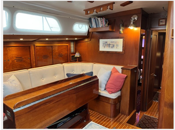
50' Hinckley Sou'wester 1977 (BACCARA) Saloon