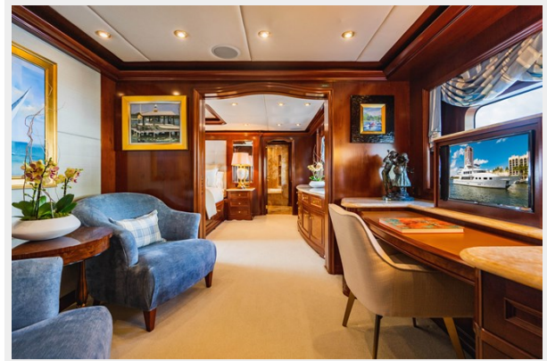
Master Stateroom Office