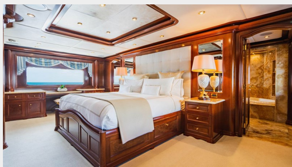
Master Stateroom, On-Deck