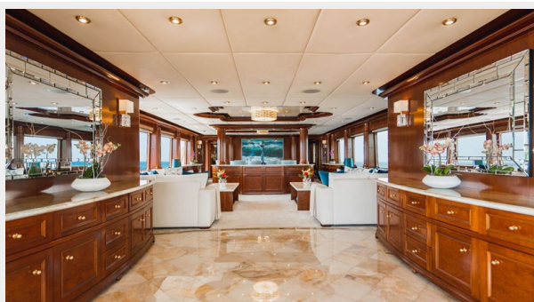
Main Salon Entry