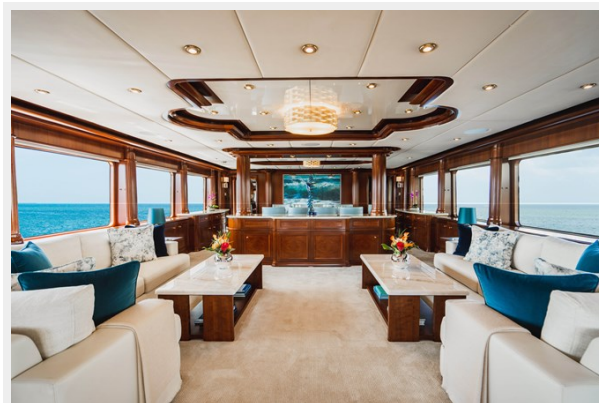
Main Salon, Forward