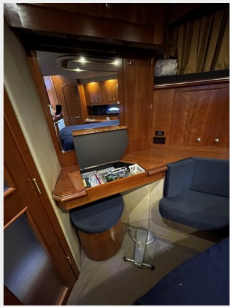
Master SR Make-Up Table