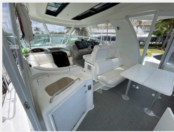
Aft Deck Looking Forward