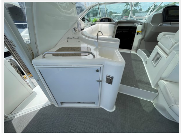
Aft Deck Refrigeration, Freezer, Sink