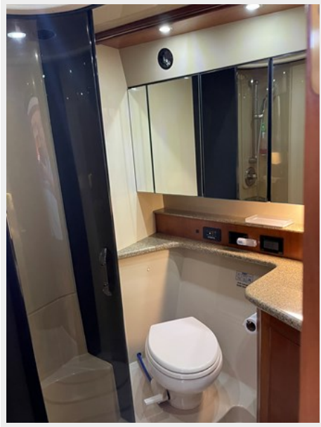
Day Head with Shower