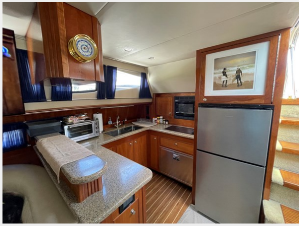
Galley to Starboard