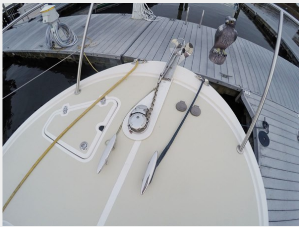
Foredeck w Windlass