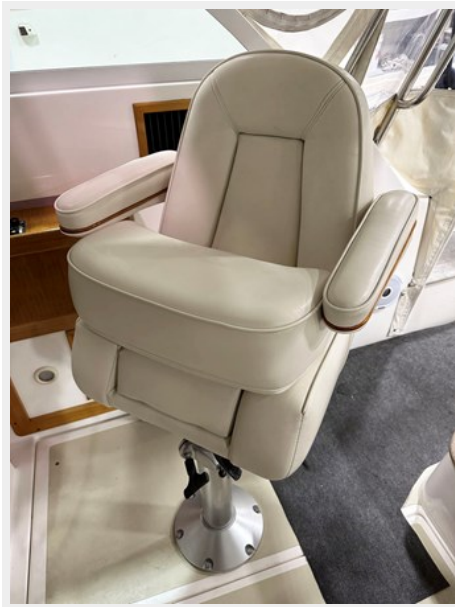
Helm Chair w Lifting Bolster