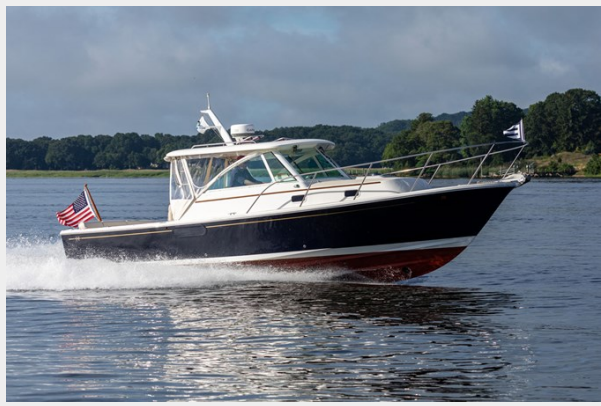
Starboard Beam Running