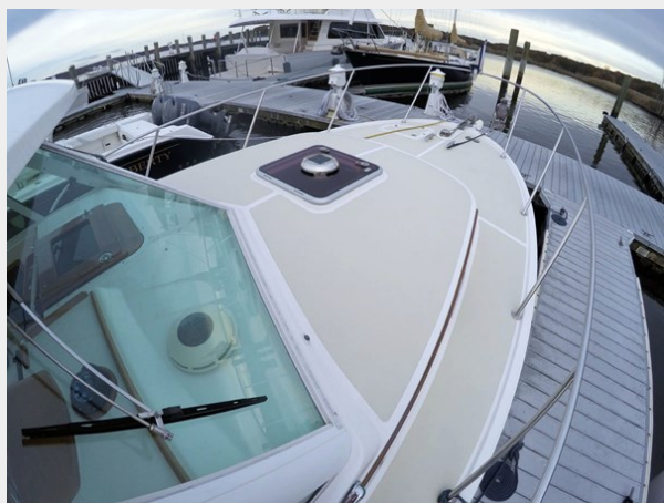
Deck Looking Forward