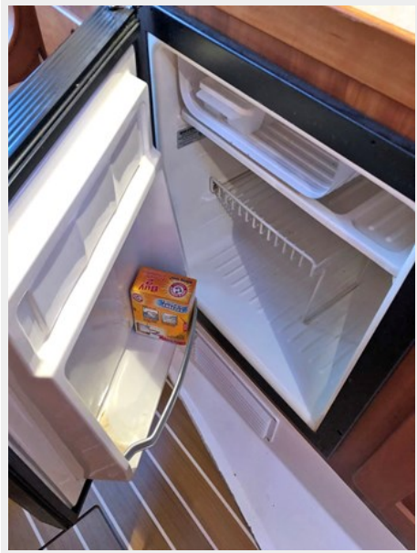
Fridge w Freezer