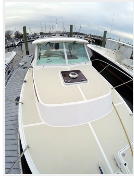
Windshield from Foredeck