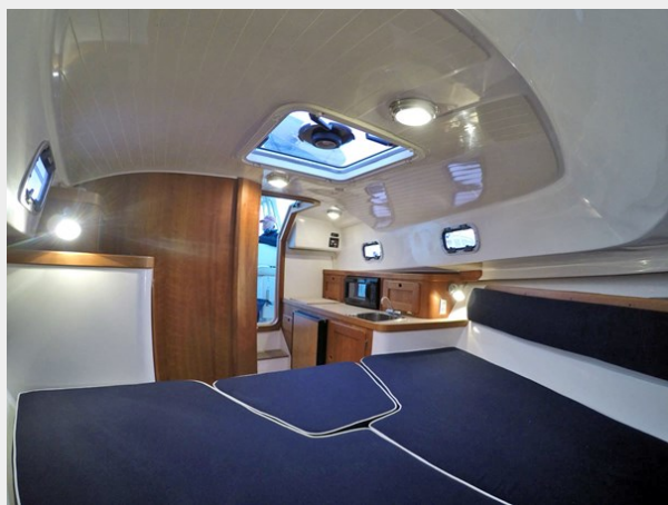
Interior Looking Aft