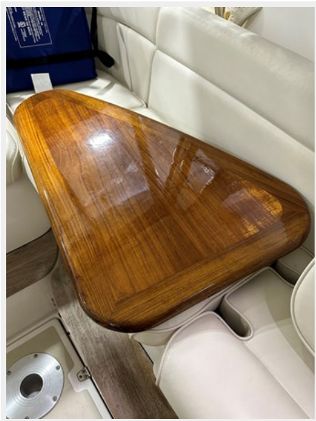
Teak Bridgedeck Table