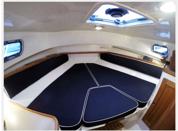
Vee Berth w Filler