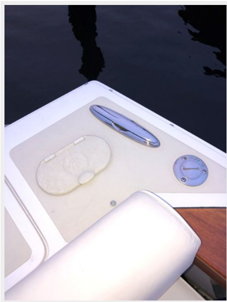
Aft Deck Detail