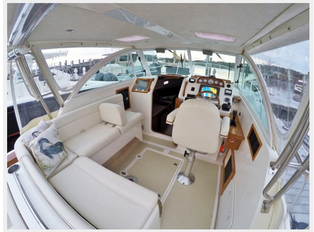
Pilothouse Looking Forward