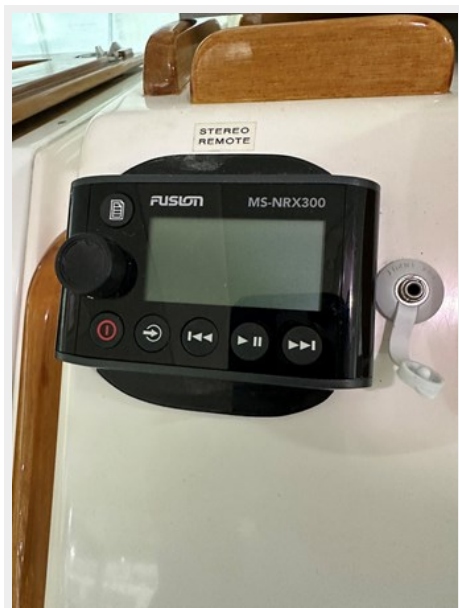
Stereo Remote at Helm