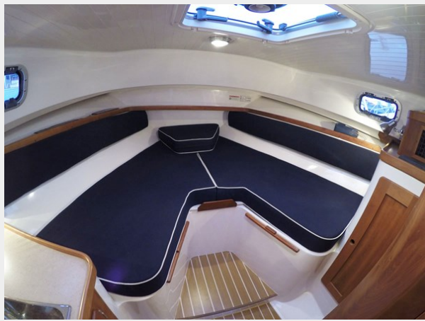
Vee Berth no Filler