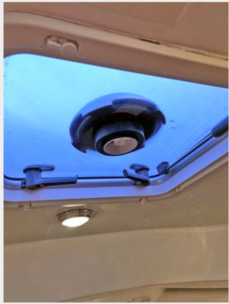
New Solar Vent w Fan