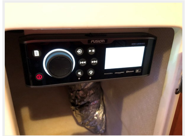
New Bluetooth Stereo