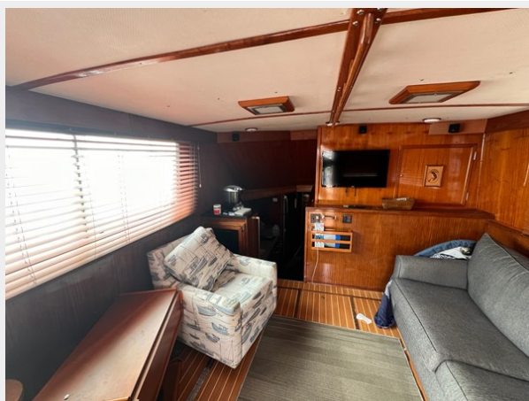
Library - 7 of 14