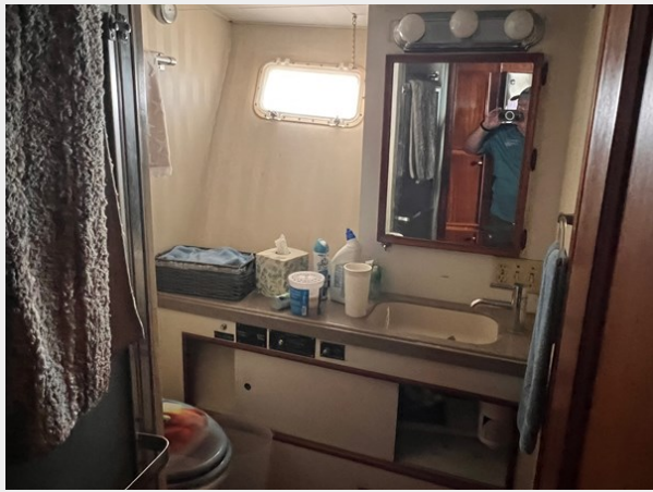
Library - 12 of 14