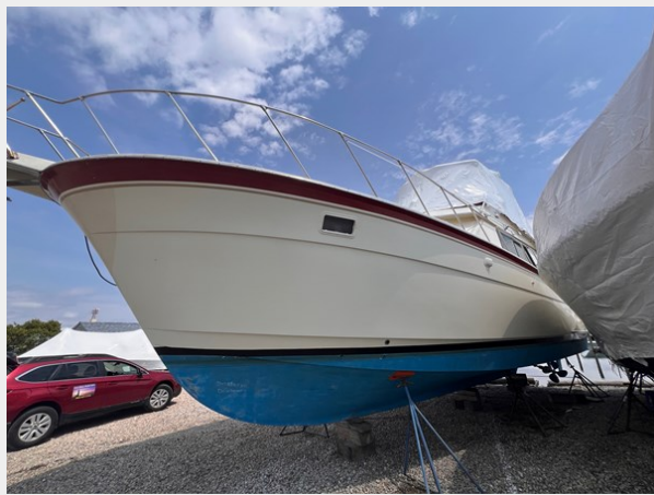
Library - 2 of 14