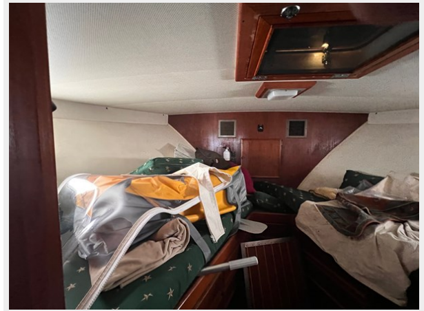
Library - 13 of 14