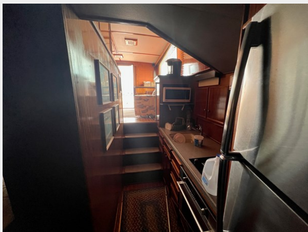
Library - 14 of 14