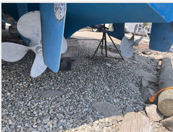
Library - 5 of 14