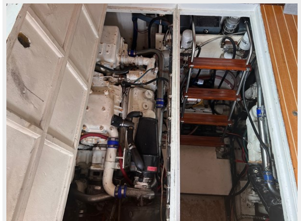
Library - 6 of 14