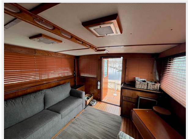
Library - 8 of 14