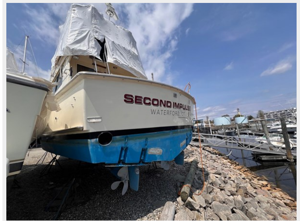
Library - 3 of 14