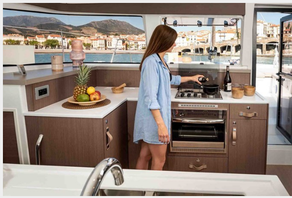
Bali 4.2 Gallery 8