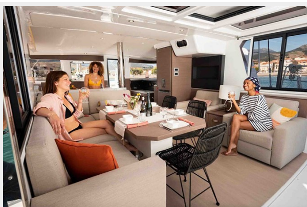
Bali 4.2 Gallery 6