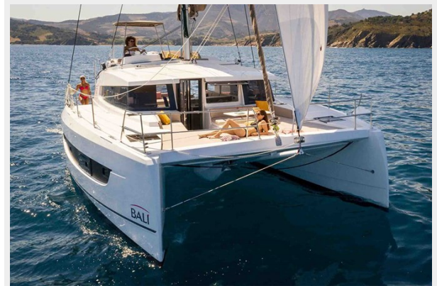
Bali 4.2 Gallery 3