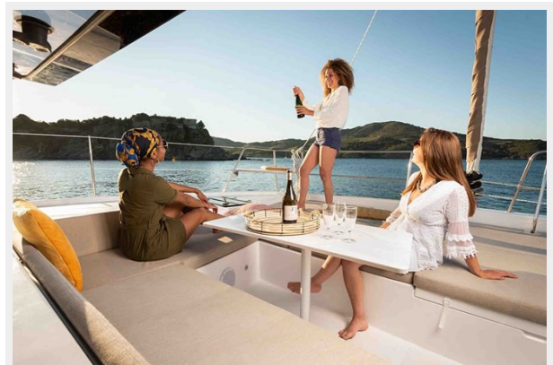
Bali 4.2 Gallery 5