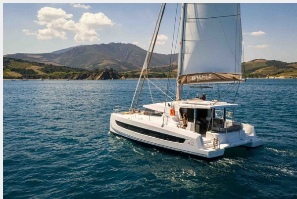
Bali 4.2 Gallery 2