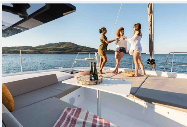
Bali 4.2 Gallery 4