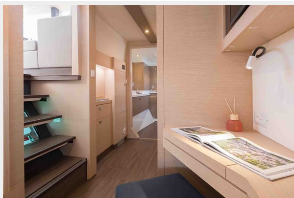
Astrea 42 Gallery 12