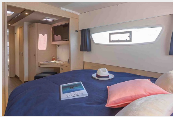
Astrea 42 Gallery 14