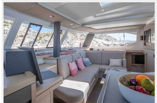
Astrea 42 Gallery 11