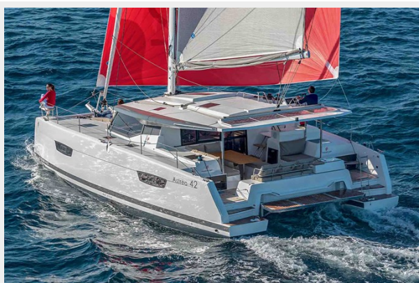
Astrea 42 Gallery 4