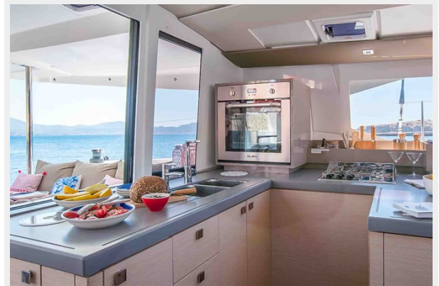
Astrea 42 Gallery 9