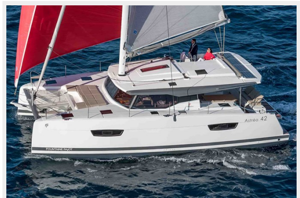
Astrea 42 Gallery 5