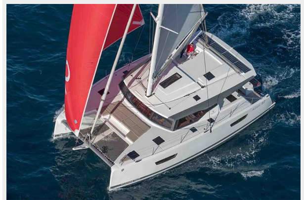
Astrea 42 Gallery 3