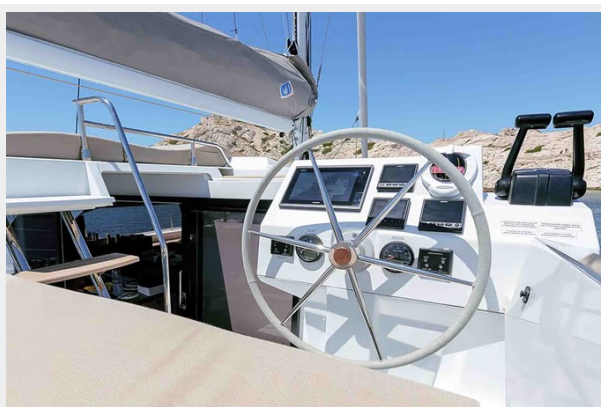
Astrea 42 Gallery 6