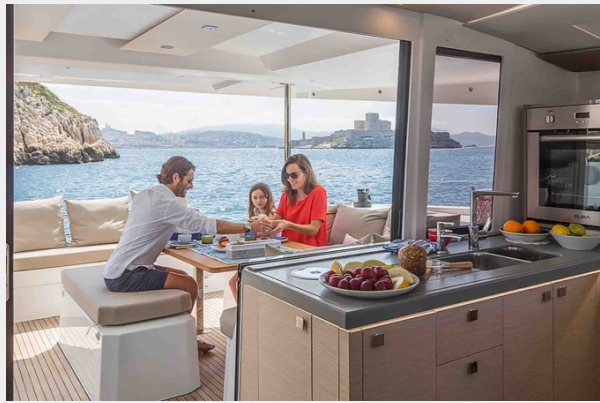
Astrea 42 Gallery 8