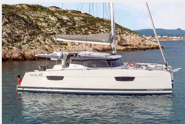
Astrea 42 Gallery 2