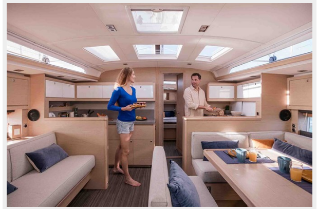
Dufour 470 Gallery 9