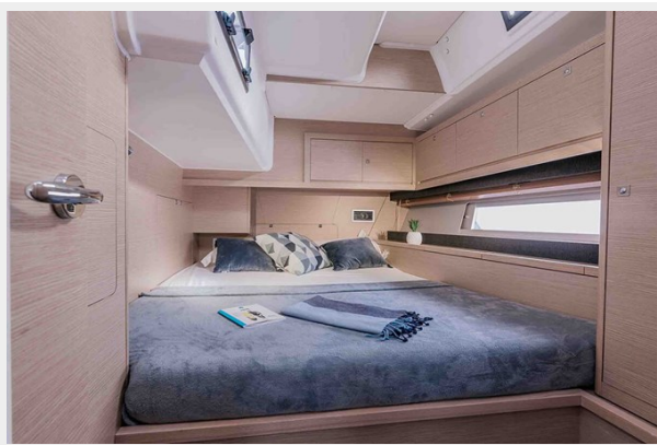
Dufour 470 Gallery 12