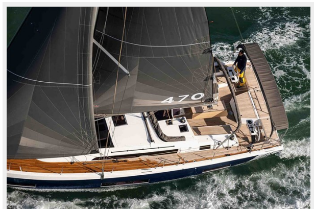
Dufour 470 Gallery 5