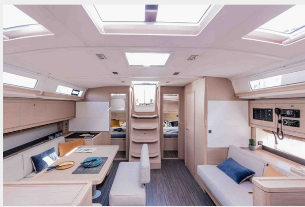
Dufour 470 Gallery 10