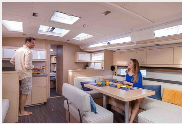
Dufour 470 Gallery 8