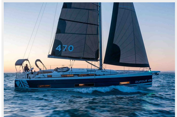
Dufour 470 Gallery 3