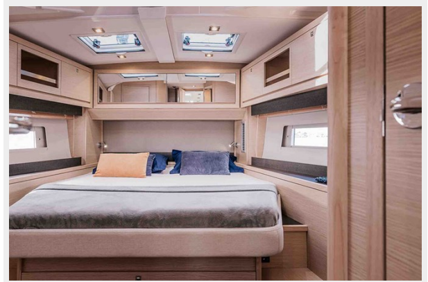
Dufour 470 Gallery 11