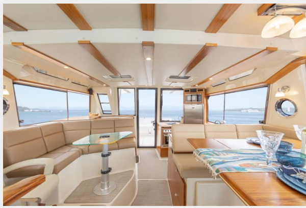
2023 Ranger Tugs 43 Command Bridge - Looking aft towards stern inside Main Salon