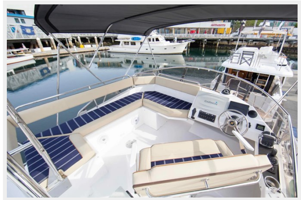
2023 Ranger Tugs 43 Command Bridge - Flybridge Seating uncovered