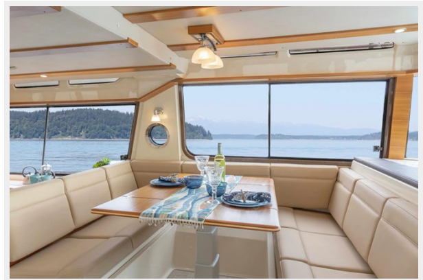
2023 Ranger Tugs 43 Command Bridge - Dinette