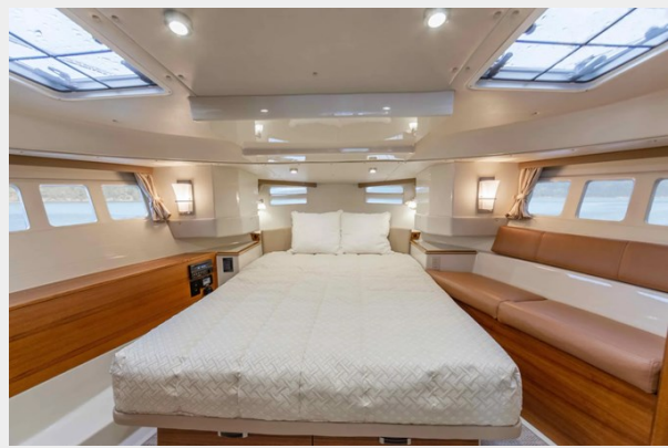
2023 Ranger Tugs 43 Command Bridge - Another veiv of Owner's cabin berth with windows uncovered