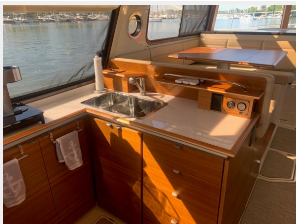
2023 Ranger Tugs 43 Command Bridge - Galley Counter