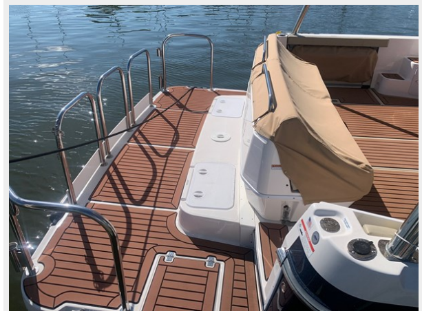
2023 Ranger Tugs 43 Command Bridge - Swim Platform