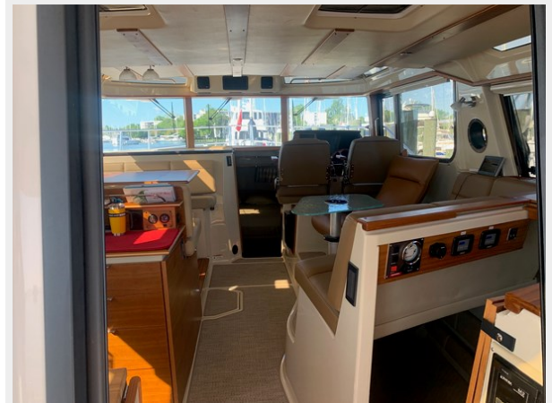
2023 Ranger Tugs 43 Command Bridge - Looking forward at helm