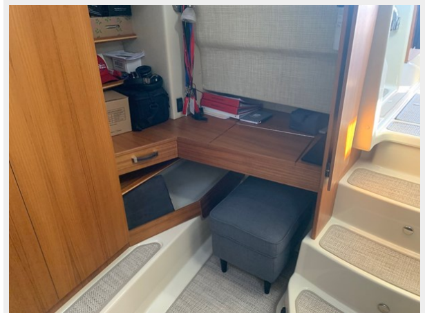
2023 Ranger Tugs 43 Command Bridge - Desk in Owner's Cabin