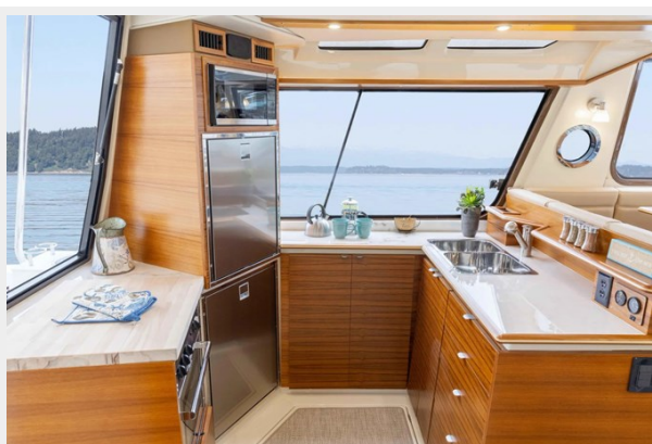
2023 Ranger Tugs 43 Command Bridge - Galley