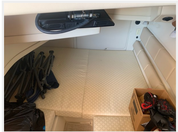
2023 Ranger Tugs 43 Command Bridge - Aft cabin King Size berth