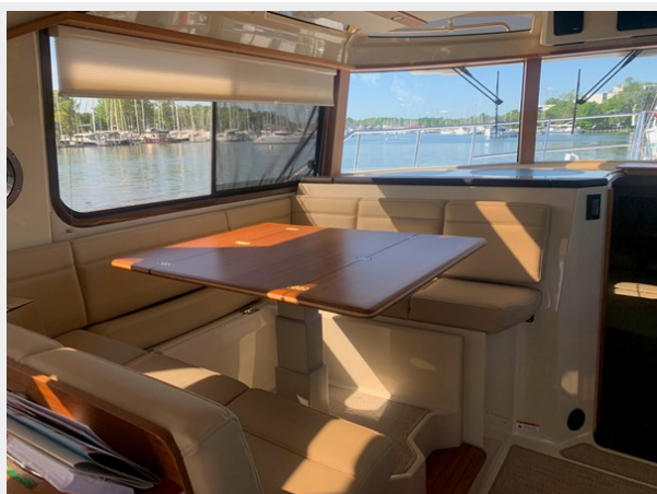
2023 Ranger Tugs 43 Command Bridge - Another view of Dinette