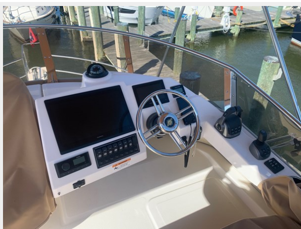
2023 Ranger Tugs 43 Command Bridge - Flybridge helm