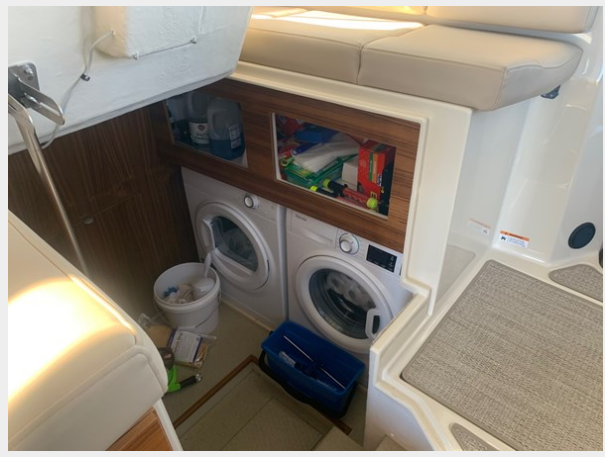
2023 Ranger Tugs 43 Command Bridge - Side by side washer/dryer under lifting Dinette Table