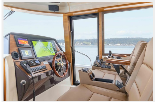
2023 Ranger Tugs 43 Command Bridge - Helm