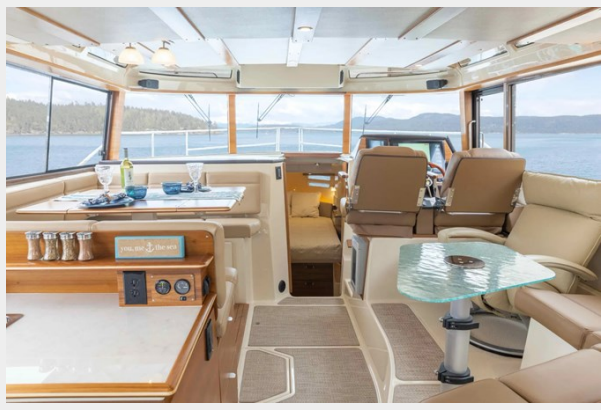
2023 Ranger Tugs 43 Command Bridge - Main Salon