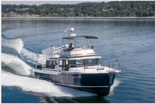
2023 Ranger Tugs 43 Command Bridge - On the water 2023 Ranger Tugs 43 Command Bridge - On the water