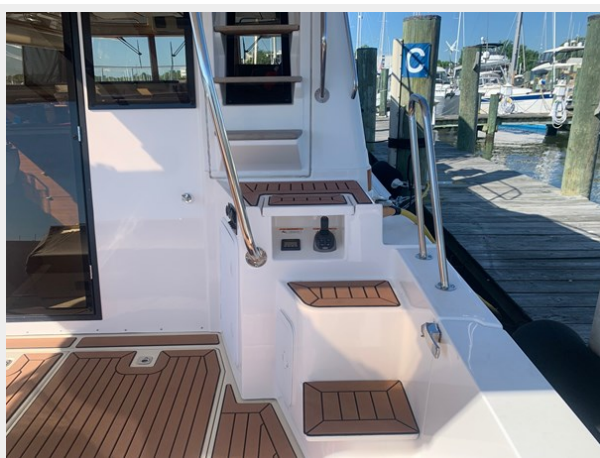
2023 Ranger Tugs 43 Command Bridge - Aft Stering Station and Staircase to Flybridge