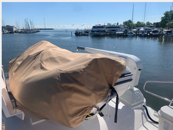
2023 Ranger Tugs 43 Command Bridge - Dinghy and Crane on Flybridge covered