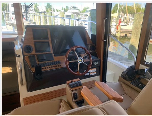
2023 Ranger Tugs 43 Command Bridge - Another view of helm