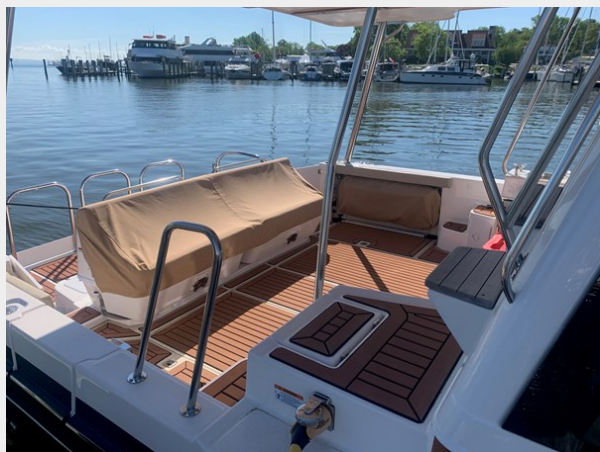
2023 Ranger Tugs 43 Command Bridge - Cockpit