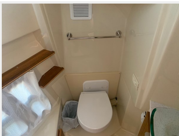
2023 Ranger Tugs 43 Command Bridge - Aft Cabin head