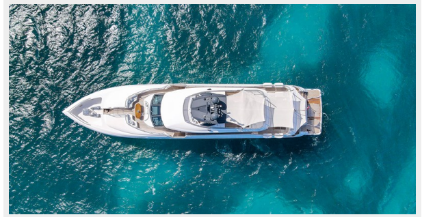
Aerial View 8