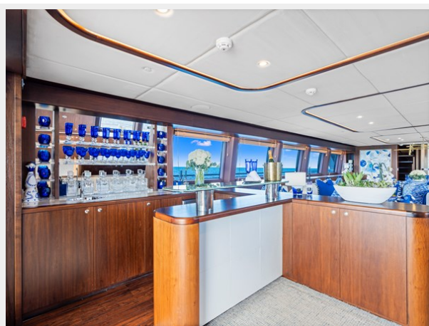
Main Salon Bar Area 2