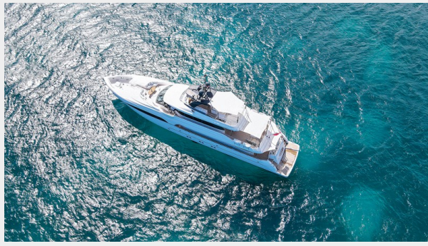
Aerial View 7