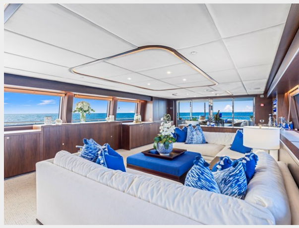
Main Salon Seating 4