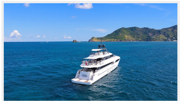
Aerial View 10