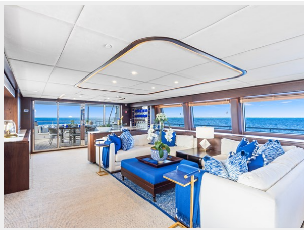
Main Salon Seating 2