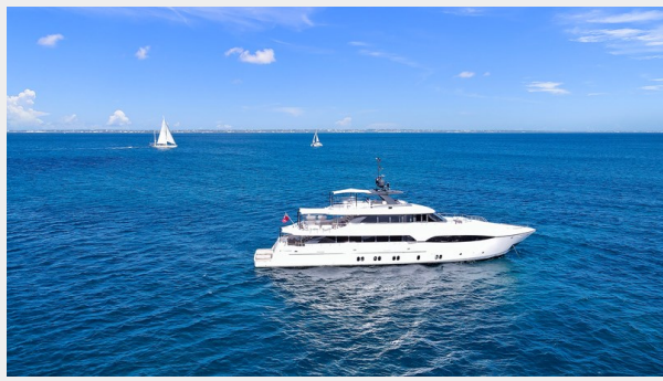
Aerial View 1