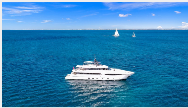
Aerial View 3