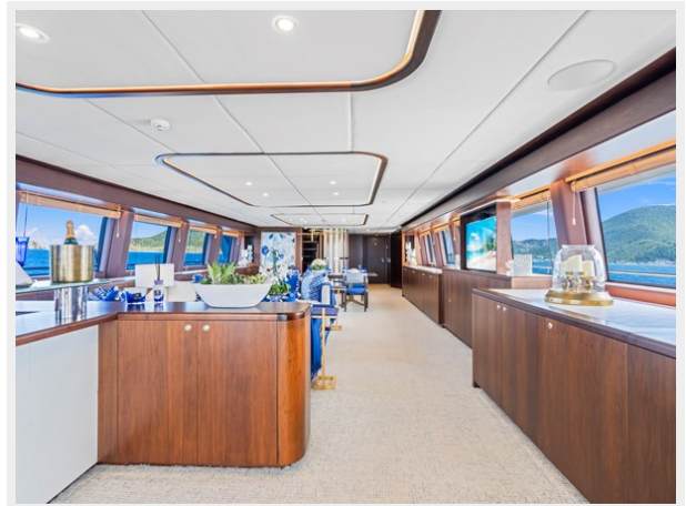
View Of Bar, Main Salon & Dining Area From Main Aft Deck Entrance