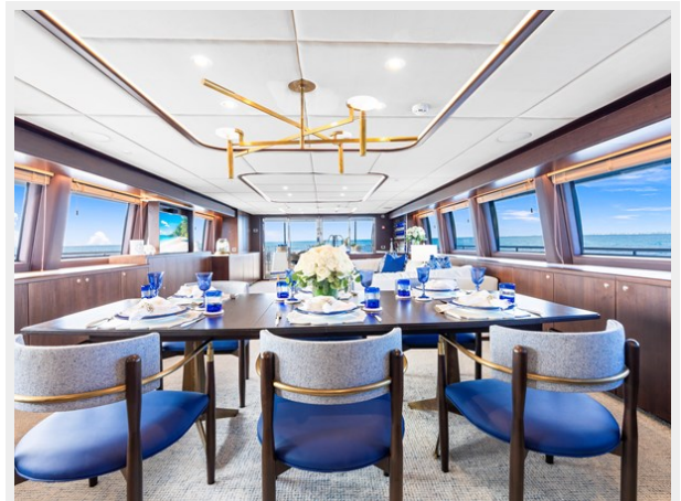
Main Dining Table View 2