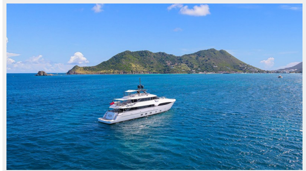
Aerial View 4