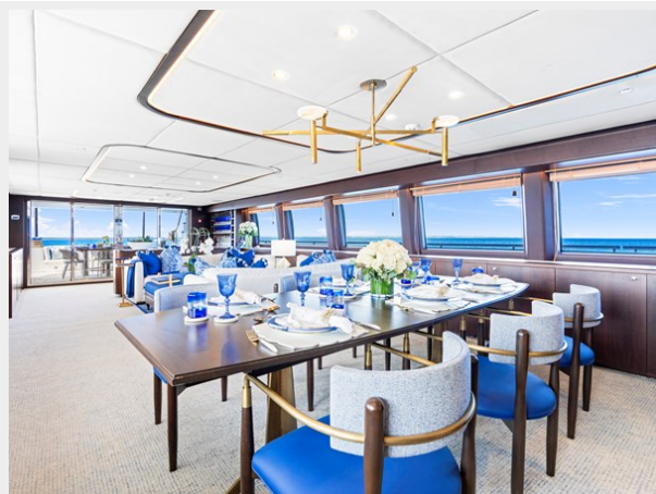
Main Dining Table View 1