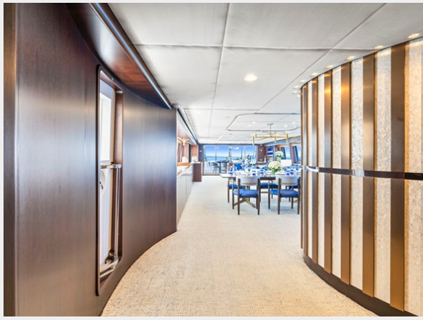
Main Foyer Main Guest Side Entrance