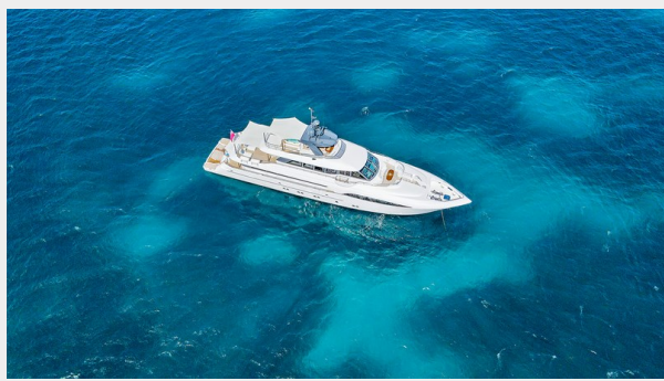
Aerial View 5