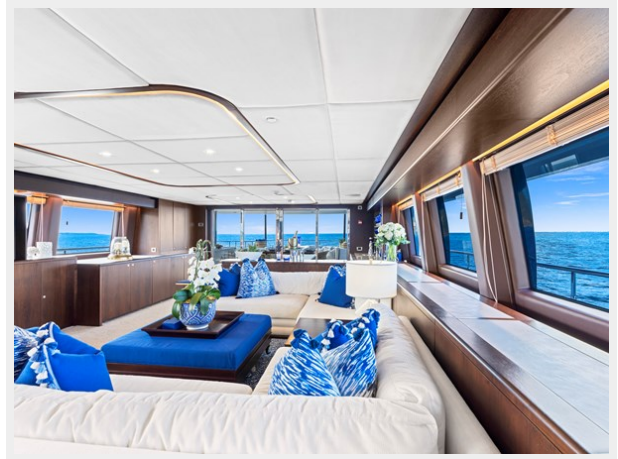
Main Salon Seating 1