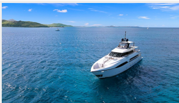
Aerial View 11