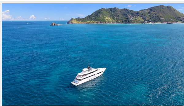
Aerial View 9