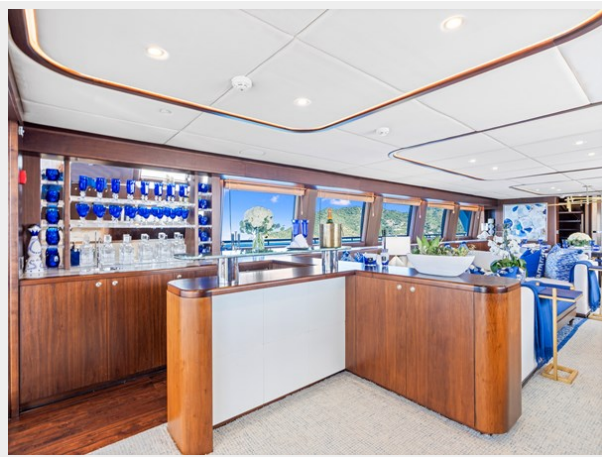
Main Salon Bar Area