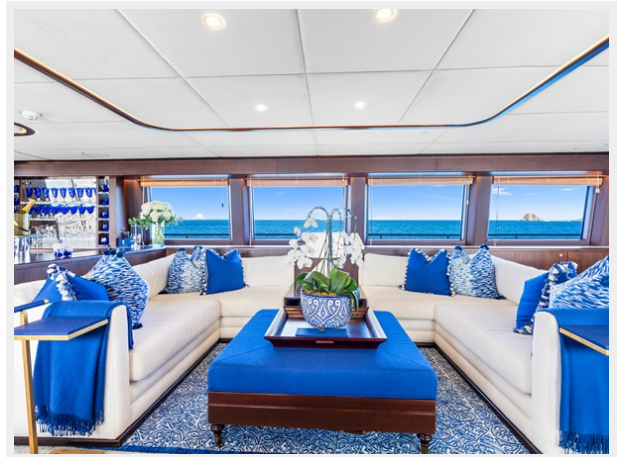
Main Salon Seating 3