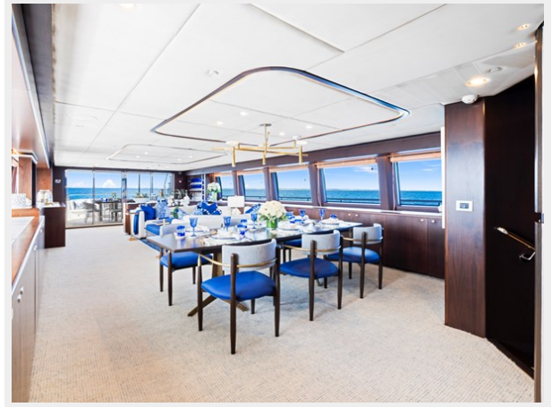
Main Dining Table View From Main Foyer