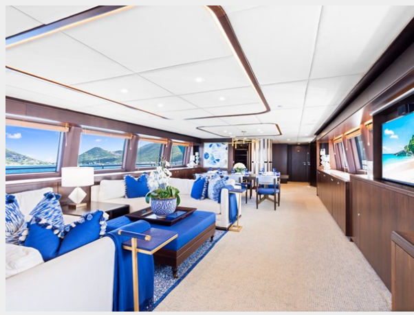
Main Salon View From Main Aft Entrance 3