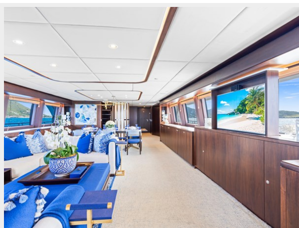
Main Salon View From Main Aft Entrance