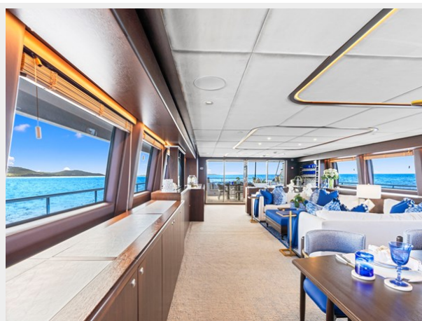
Main Salon Starboard TV Installation