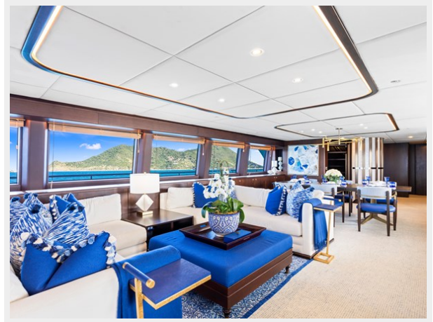
Main Salon View From Main Aft Entrance 4