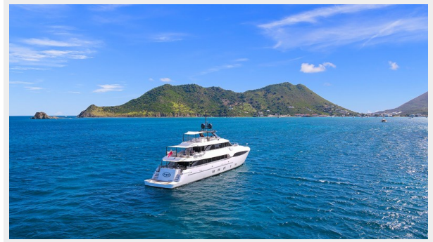
Aerial View 2