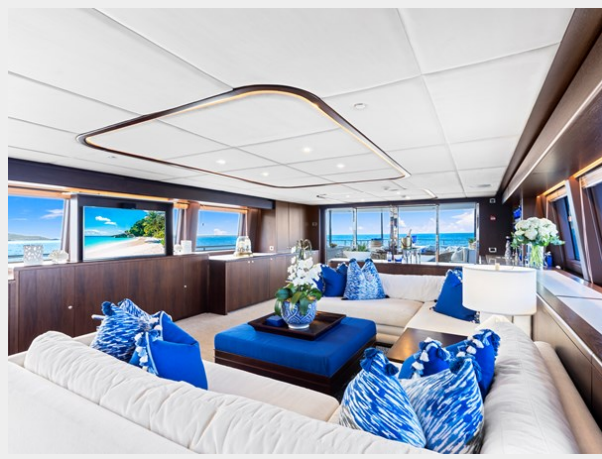
Main Salon Seating