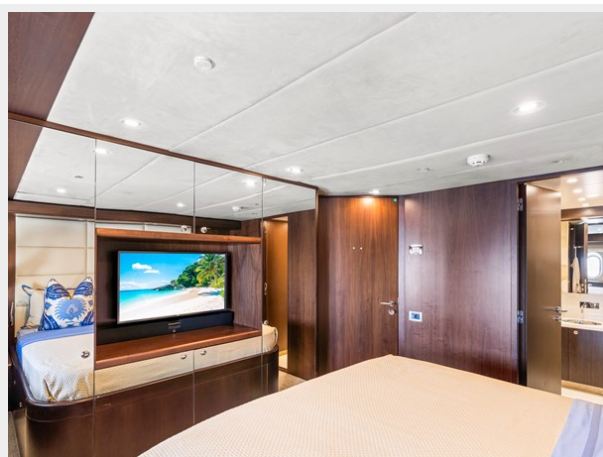
Cabin 3 Facing Cabin Door