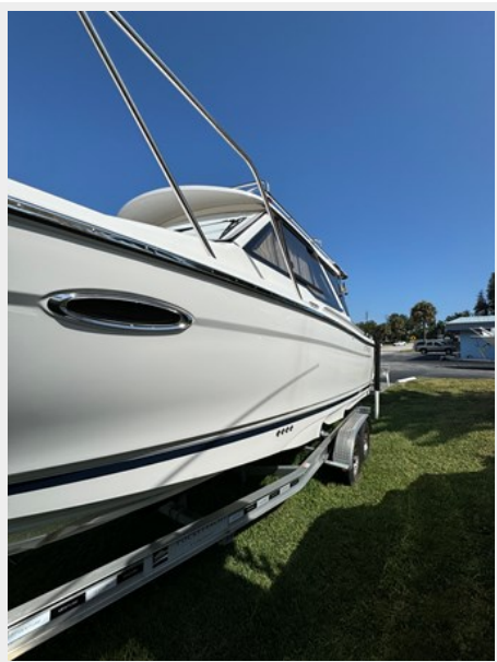
Port Side 3