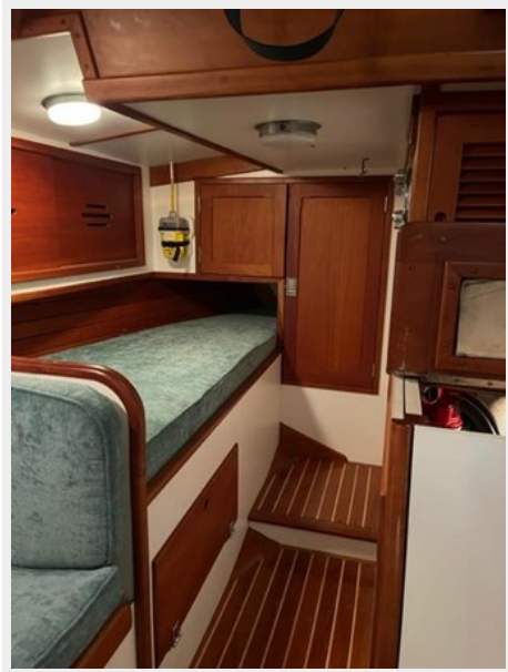
Walk-In Aft Quarter Berth