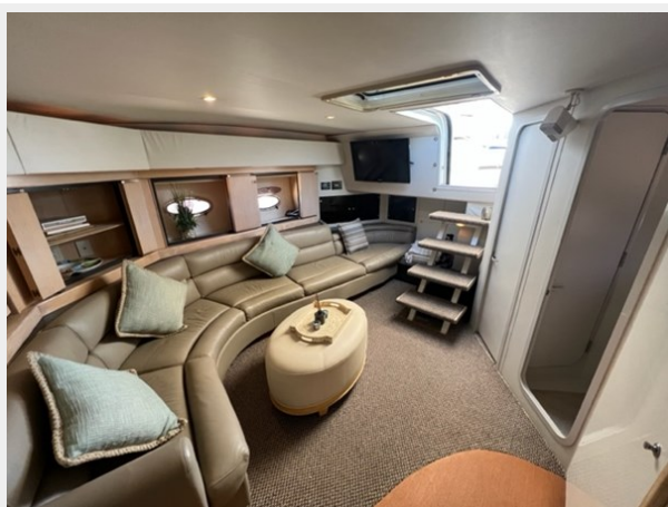
Salon View Aft