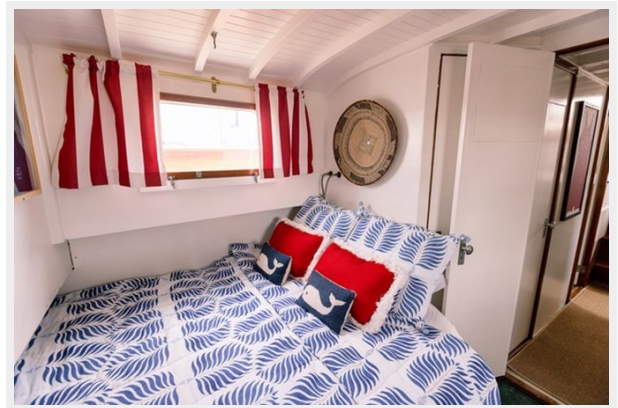
Master Stateroom 2