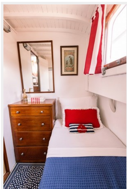
Guest bunk port