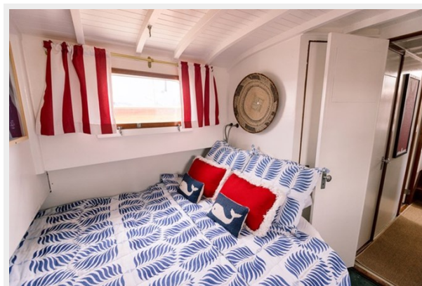
Master Stateroom 2