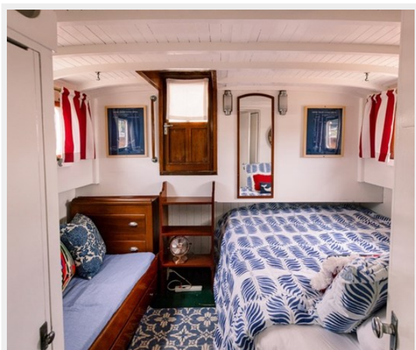
Master Stateroom 1