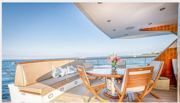
STERN AREA 2 (1)