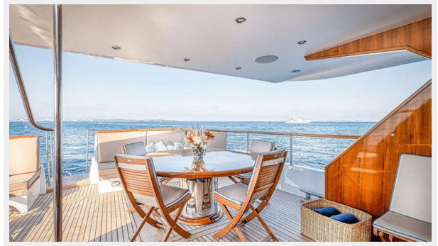
STERN AREA 4