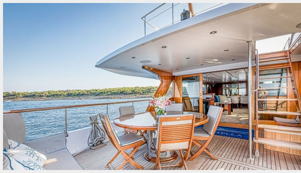
STERN AREA 3