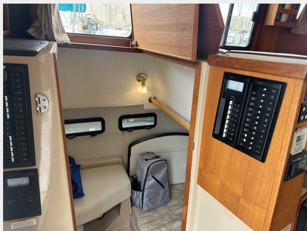
2017 Ranger Tug Sedan Aft Birth with day head