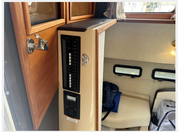
2017 Ranger Tug Sedan AC panel