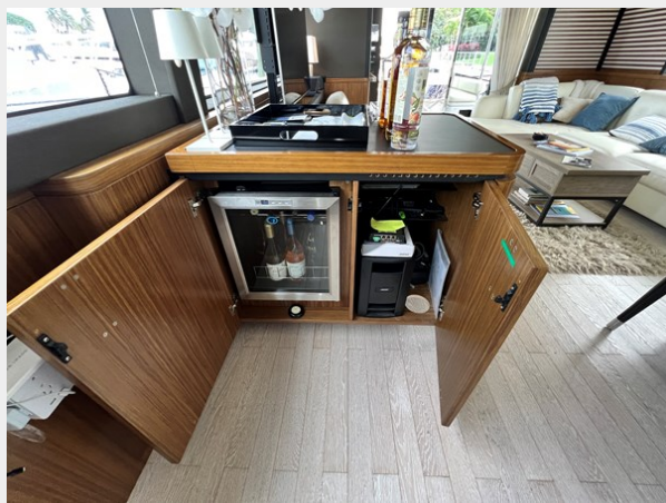
Salon wine cooler