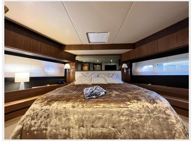
VIP FWD 2