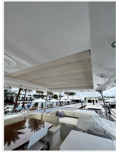
Retractable Sunroof on Hard Top