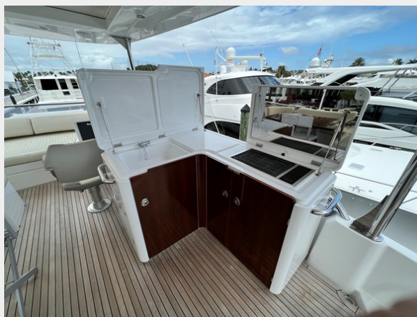
Wet Bar and BBQ at Flybridge