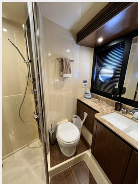
VIP Ensuite Bathroom