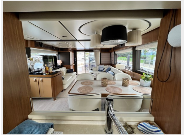
View from Galley