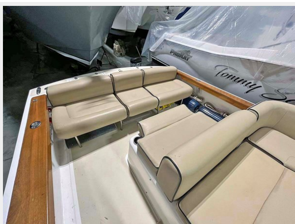
Convertible Transom Settee