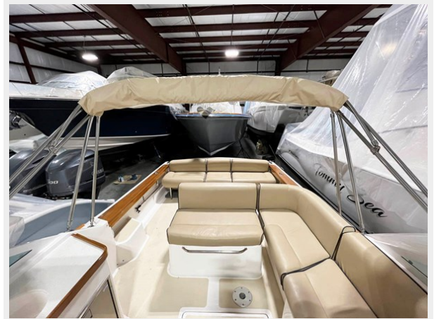
Bridgedeck Looking Aft