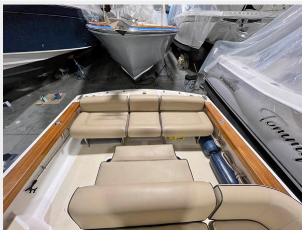
Cockpit Settee and Engine Box Seating