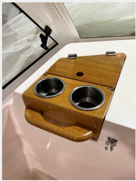
Teak Glovebox and Drinkholders