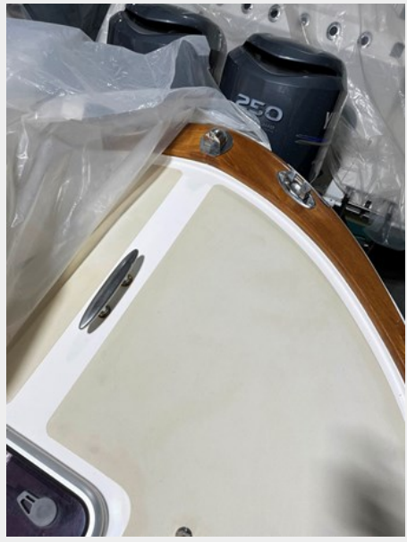
Pop up Bow Chalks and Running Light