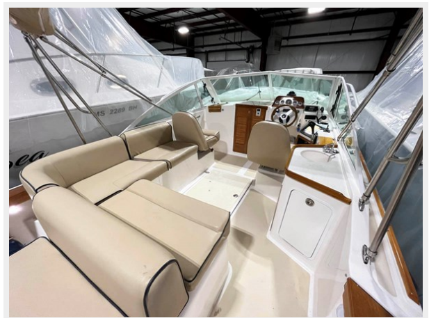
Bridgedeck Seating Looking Forward