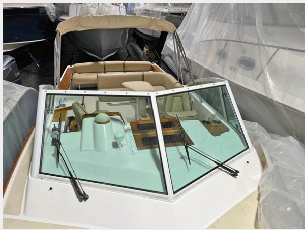
Looking Aft Through Windshield