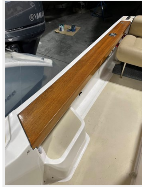
Varnished Teak Cockpit Coaming Board