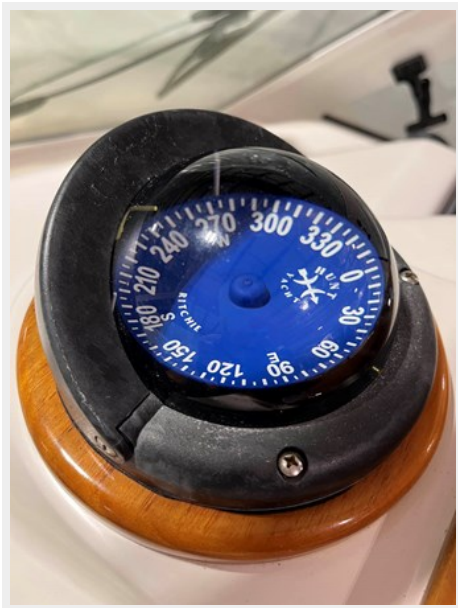
Ships Compass w Hunt Logo