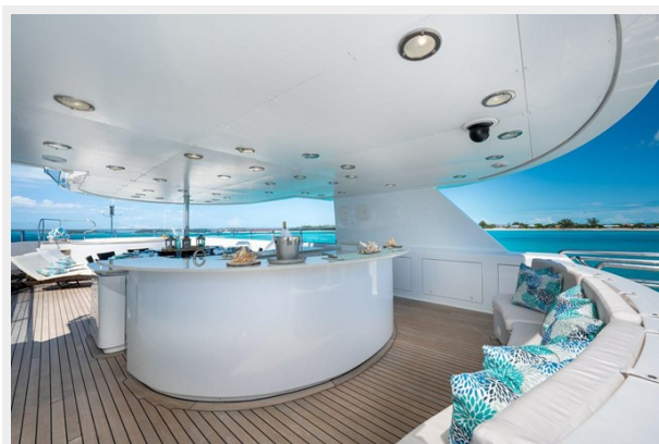
Sun Deck Bar