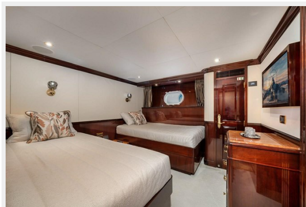
Guest 3 Stateroom