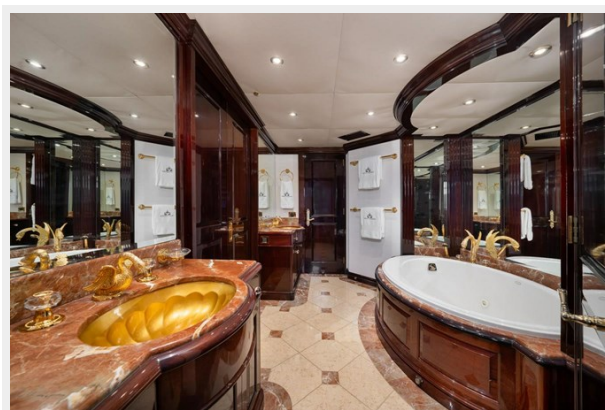
Master En Suite