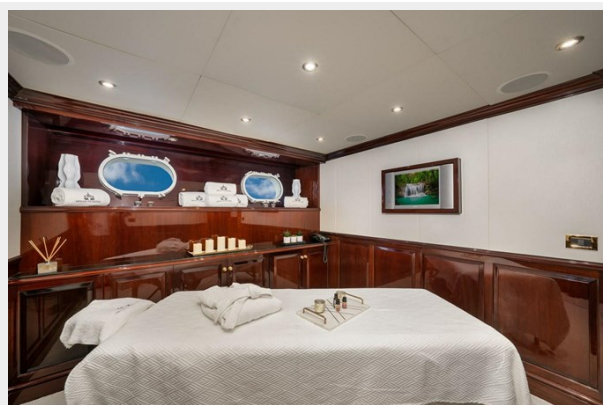
Guest 5 Stateroom OR Massage Room