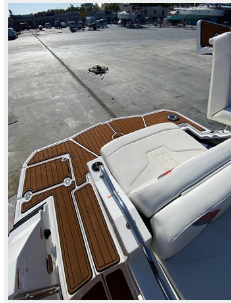
WhatsApp Image 2024-04-27 at 19.02.16