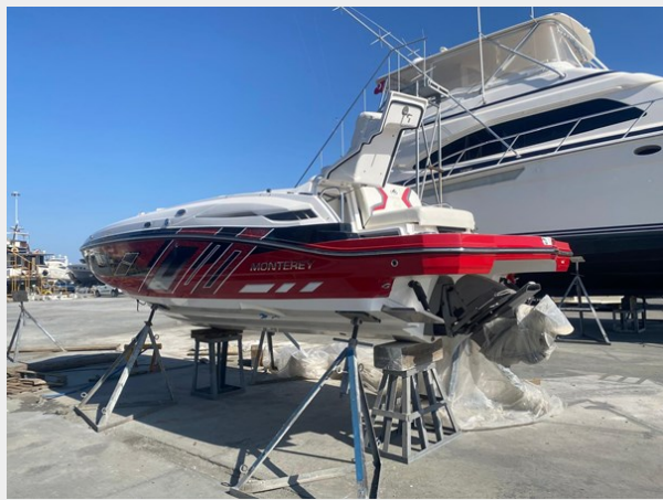
WhatsApp Image 2024-04-27 at 19.02.15 (3)