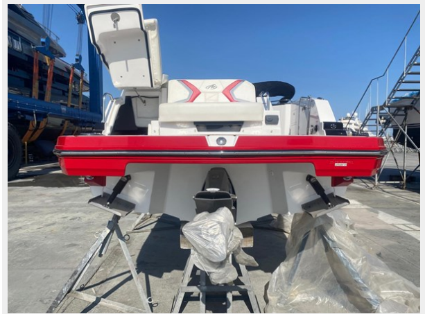
WhatsApp Image 2024-04-27 at 19.02.15