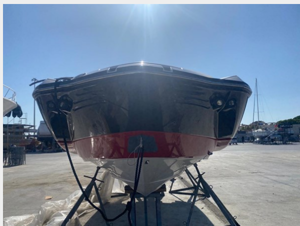
WhatsApp Image 2024-04-27 at 19.02.15 (4)