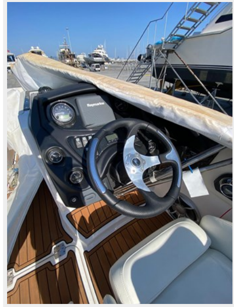
WhatsApp Image 2024-04-27 at 19.02.16 (3) WhatsApp Image 2024-04-27 at 19.02.16 (4)